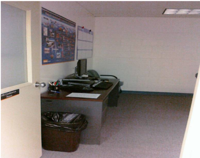
Plate 9: HR office