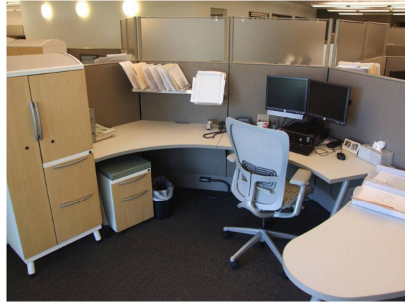
Plate 2: After sorting

With the completion of the Sort phase, we realized three main results: