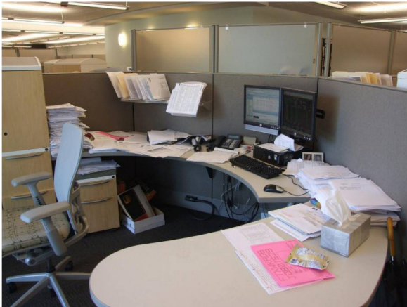
Plate 1: Before sorting

The area for needed items was sub-divided into (a) frequently (b) occasionally (c) rarely used items. Separate labels were used to indicate potentially hazardous materials. After the unused items were gathered, they were moved to “Red Tag” area. Clearly visible labels and signs were used to make the purpose of this area clear. Signs described the process of turning in items for collection. An evaluation was performed on the items in “Red Tag”. Items that are potentially useful were subsequently labeled for cleaning and storage. But tools or implements that were no longer useful were discarded immediately. Plate 1 shows an office before the Sort phase. The same office is shown in Plate 2 after the Sort phase.