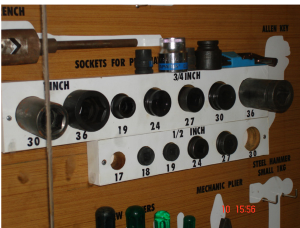
Plate 3: Maintenance

Plates 3 and 4 show the outlook of some maintenance and workshop tool stations after the Sort and Shine phases. Easy identification of tools and buttons are obvious in these stations.