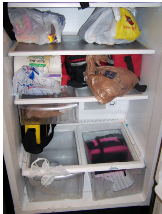
Plate 6: Café