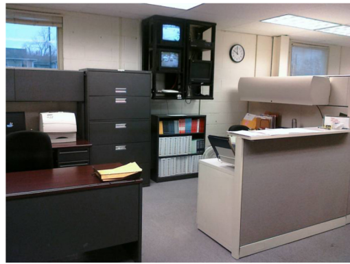
Plate 8: Accounting office