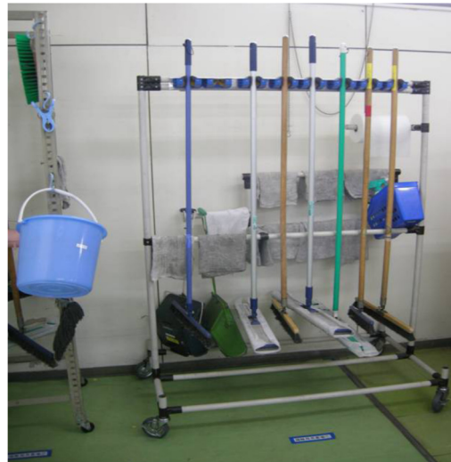
Plate 10: Janitorial tools station

The Shine phase was considered very important and team members had to really focus not only on cleaning the area, but also finding the root cause(s) of contamination. They were to find and document the root cause of the un-cleanliness problem in each workplace so as to help eliminate the problem. When a team found a dirty area, members were to ask themselves: how can we prevent this from getting dirty again? Similarly, at the discovering of oil leaks, lose or missing covers; this question was rehearsed so as to identify opportunities to improve or eliminate the problem. The purpose was to create awareness and help team members develop root cause analysis skills. In this way, a little effort in the beginning could reduce the necessity for deep cleaning later. As employees clean their work areas, they become familiar with the basic functions of the tools and equipment and enjoy greater safety and higher productivity. Cleaning operations can coincide with equipment evaluations in order to ensure that proper care and maintenance are done.