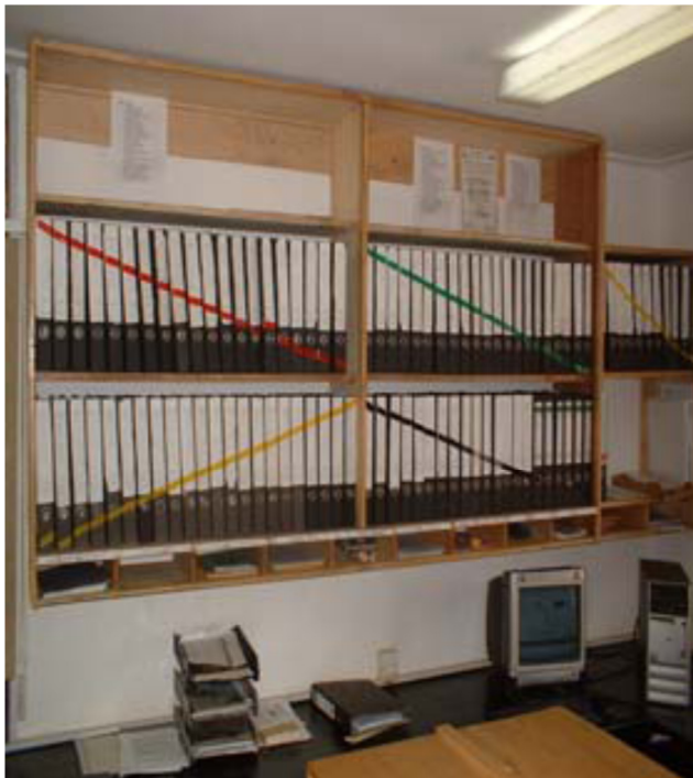
Plate 5: IT office

Plates 5, 6, 8, 9, and 10; show some offices and workstations after the Shine phase. Plate 7 shows an almost completed Sales office during the Shine phase. These cases are presented as samples as many of the departments in the facility have several offices.