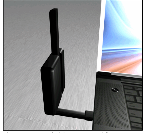
Figure 2. HField's USB wifi antenna.