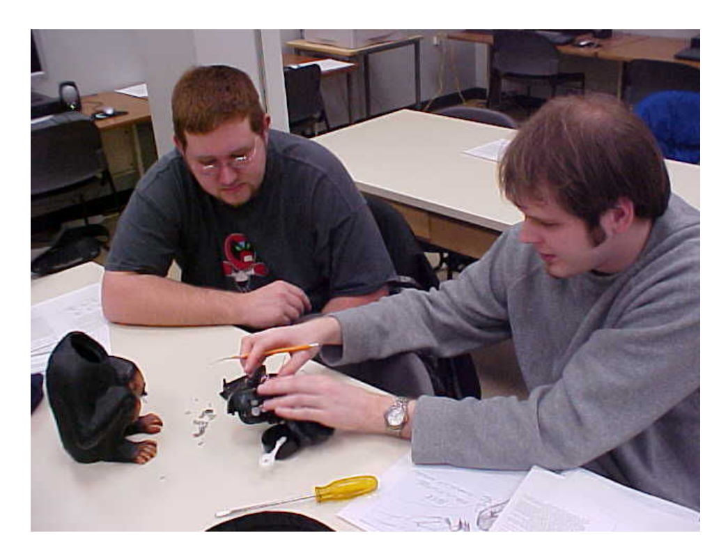
Figure 4: Reverse engineering a toy monkey