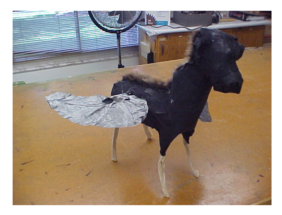
Figure 7: Integration

Students experimented with a wide range of materials varying from acrylic to metals and with adhesives and fasteners. They also learned mechanisms by evaluating various joints as shown in Figure 5 and linkages or drives as shown in Figure 4. They selected appropriate materials and mechanisms for realization of their concepts. Time constraints limited the design experience and prevented the actuators and the controls from being included within the designs. Students used manual means such as cranks or puppet wire to drive their mechanisms. Yet, the student feedback was positive and constructive. Students emphasized that they had learned a lot working in this fun and creative cross-disciplinary team environment while managing their projects.