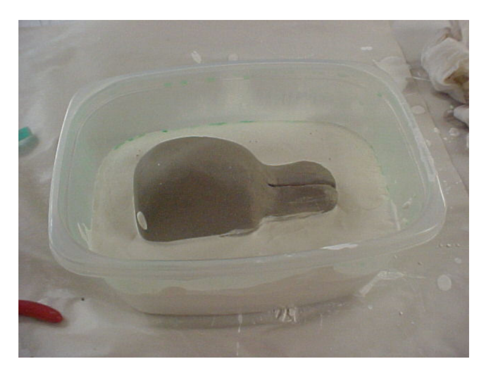
Figure 3: Using earth clay patterns in making plaster molds