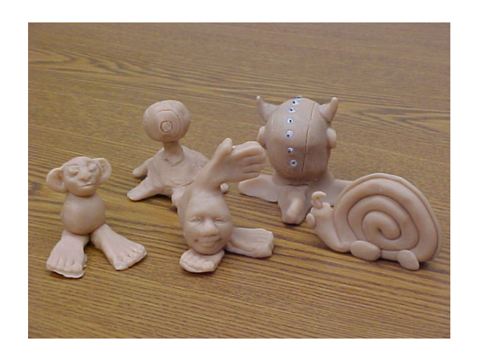
Figure 2: Modeling with polymer based clays