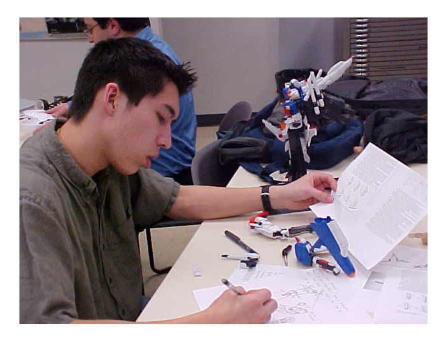
Figure 5: Study of joints through reverse engineering