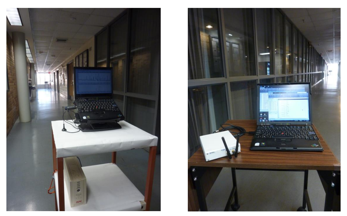
Figure 8. Indoor transmitter-receiver set-up for the mobile platform