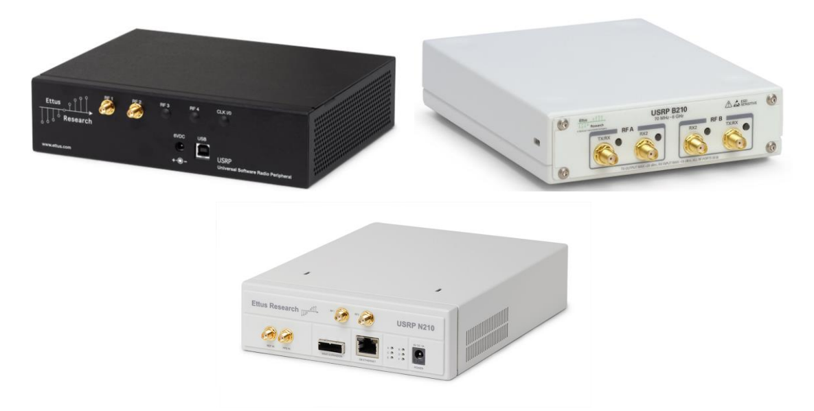
Figure 5. Metallic enclosures for the USRP1 (left), B200/210 (right) and USRP N210 (bottom).

Optional components consisting of equipment for visualizing radio signal characteristics such as a portable spectrum analyzer or oscilloscope may also be included on the platform. In addition, portable antennas with directional characteristics like the ones shown in Figure 6. Portable Yagi antennas (handheld and tripod mounted)., may also be used, to replace the omnidirectional antennas usually used in conjunction with SDR in the lab set-up.