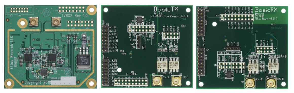
Figure 3. USRP daughterboards: (from left to right) TVRX2, Basic TX, and Basic RX.

The BasicTX and BasicRX daughterboards provide a simple, wideband interface to the digitalto-analog (D/A) and analog-to-digital (A/D) converters of the USRP1 and are ideal for basic applications that require an external RF front with bandwidth ranging from 1 to 250 MHz.