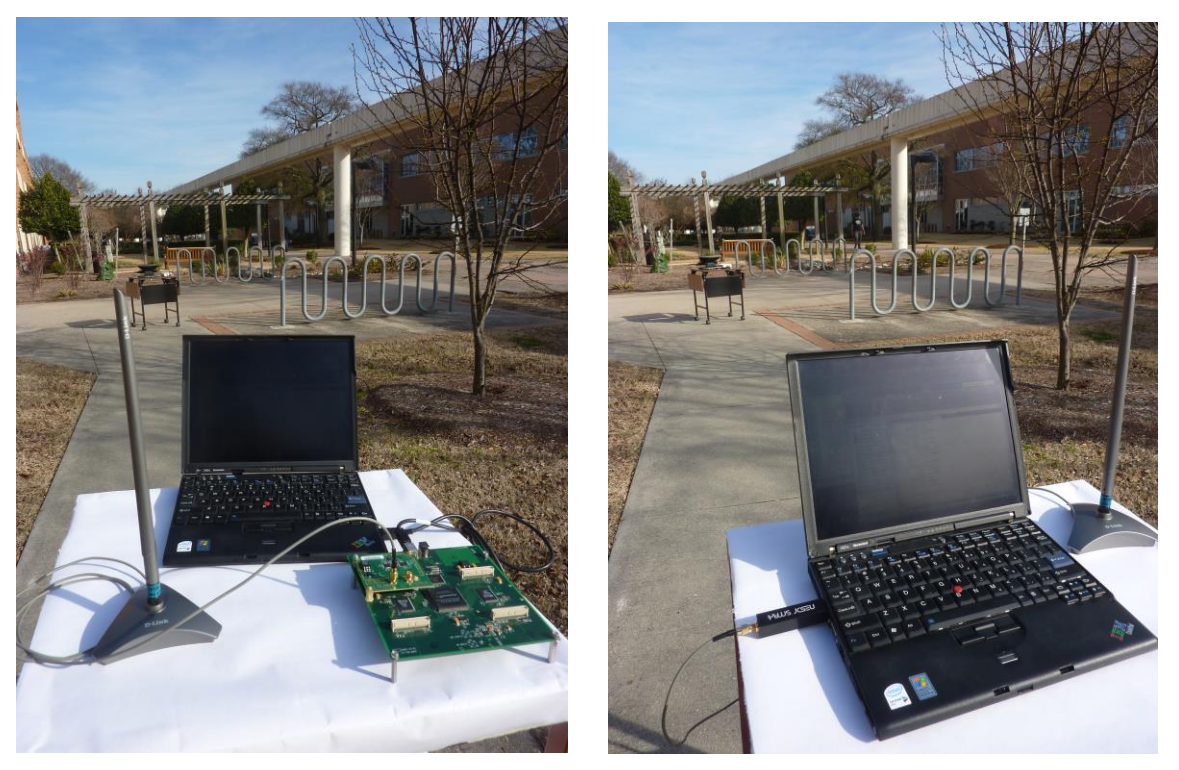
Figure 9. Outdoor transmitter-receiver set-ups for the mobile platform