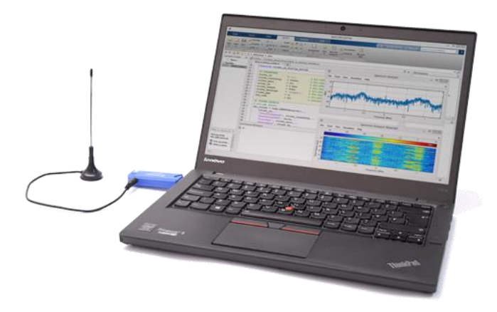
Figure 7 A Lenovo Thinkpad laptop computer with RTL-SDR USB Dongle attached.

laptop with 32-bit Core 2 processor and running Windows 7 can be used as shown in Figure 7. The same type of laptop may also be used for experimentation with the USRP1, which requires only USB 2.0, while a more recent model having the latest high-speed USB 3.0 will be useful to take full advantage of the USRP B200/210 capabilities.