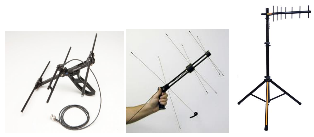
Figure 6. Portable Yagi antennas (handheld and tripod mounted).

Optional components consisting of equipment for visualizing radio signal characteristics such as a portable spectrum analyzer or oscilloscope may also be included on the platform. In addition, portable antennas with directional characteristics like the ones shown in Figure 6. Portable Yagi antennas (handheld and tripod mounted)., may also be used, to replace the omnidirectional antennas usually used in conjunction with SDR in the lab set-up.