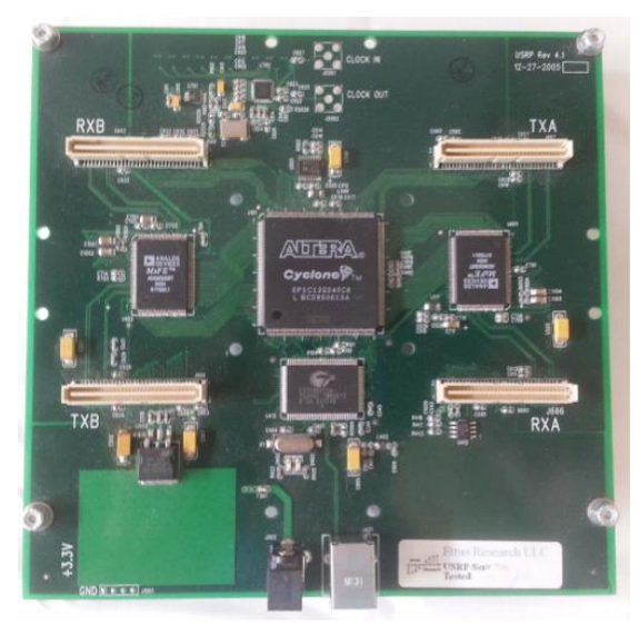
Figure 2. USRP 1 motherboard.

• The Universal Software Radio Platform (USRP) bus series, by Ettus Research (a National Instruments company), is available in two different versions. The USRP1 (shown in Figure 2) is the original motherboard that provides entry-level RF processing capabilities, with an architecture based on an Altera Cyclone FPGA featuring 64 MS/s dual ADC, 128 MS/s dual DAC and USB 2.0 connectivity with the host processor. The USRP1 has a modular design, which allows it to operate over a wide range of frequencies spanning DC to 6 GHz by using different types of daughterboards.