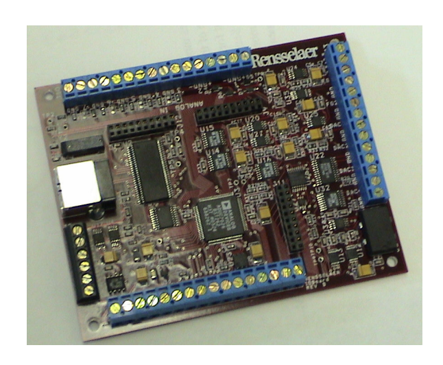
Fig.2. The Second Generation Instrumentation Board ("Red board")