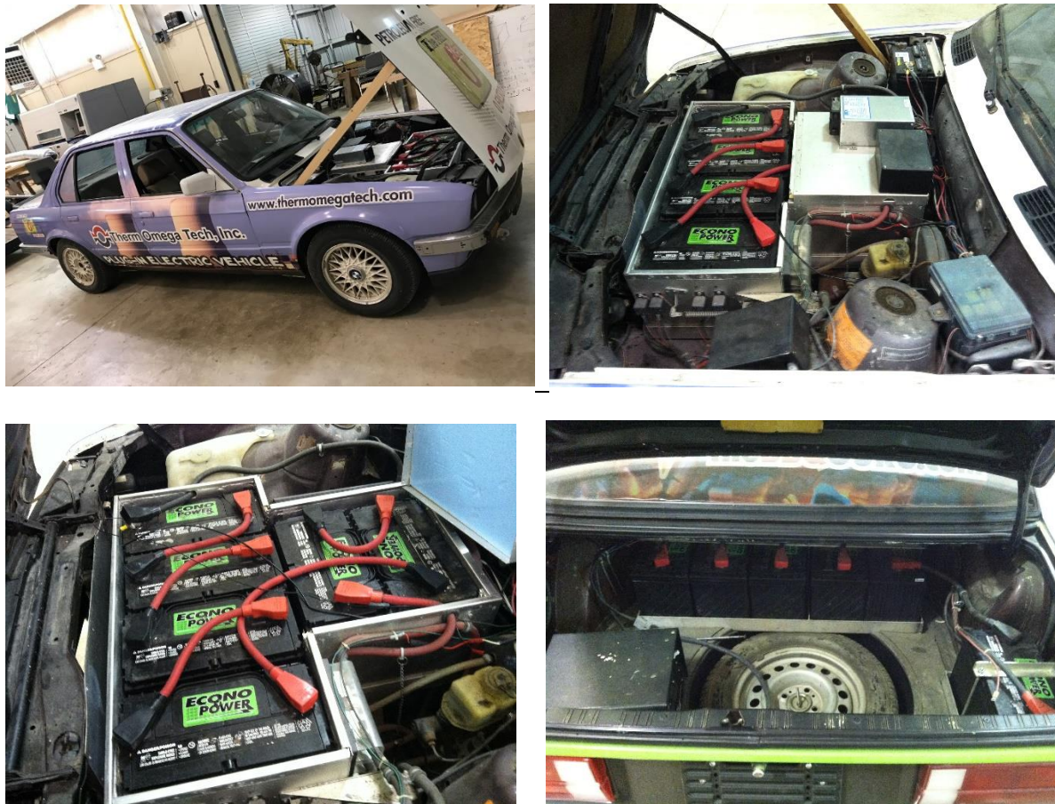
Figure 1. Electric Car