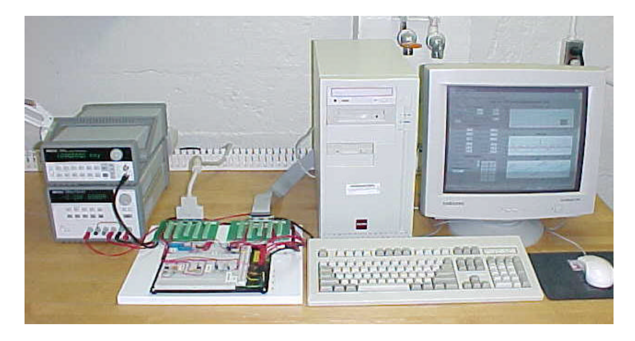
Figure 1. Picture of a complete lab station currently being used to deliver the mixed-signal laboratory curriculum.