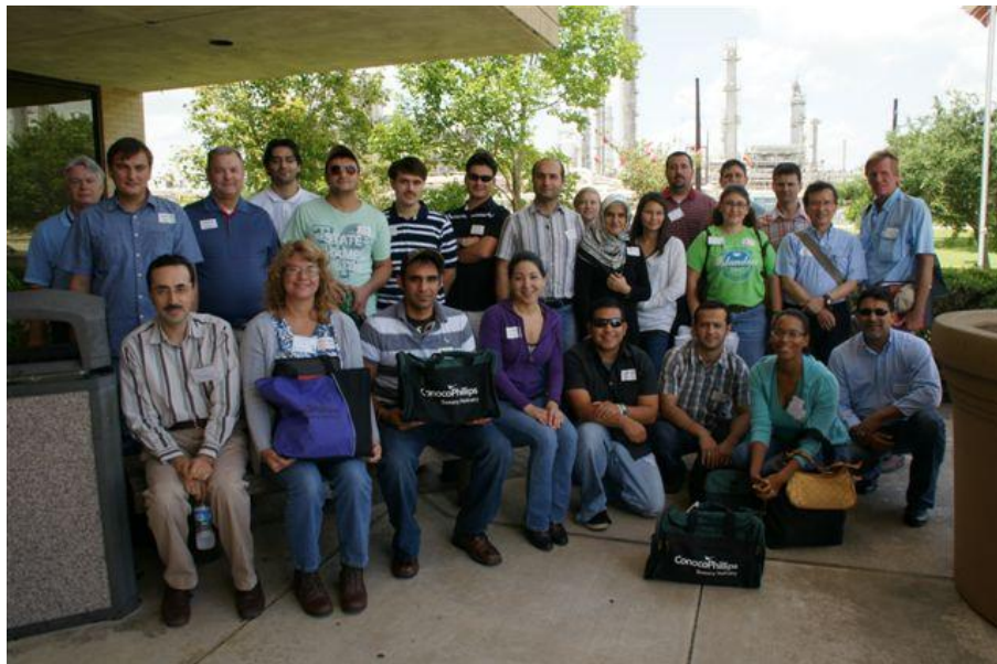
Figure 4: Workshop participants, faculty and staff at Conoco Phillips Sweeny Refinery

The trip was overall a very informative, educational and rewarding experience for the attendees, university representatives and the program's industry partners.