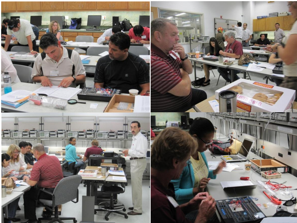
Figure 3: Snapshots from Laboratory Sessions