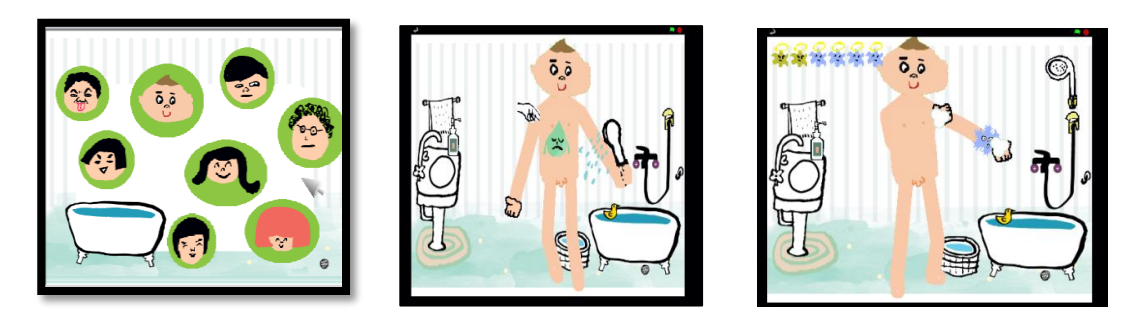
Figure 1. Shower training game designed by the student project team.