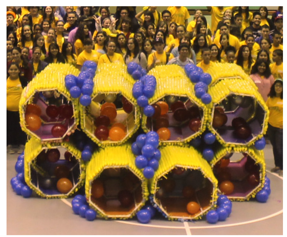
Figure 2a. 2014 Annual Club Meeting scientific model: "Nanocomposite Polymers: 21st Century Technology."