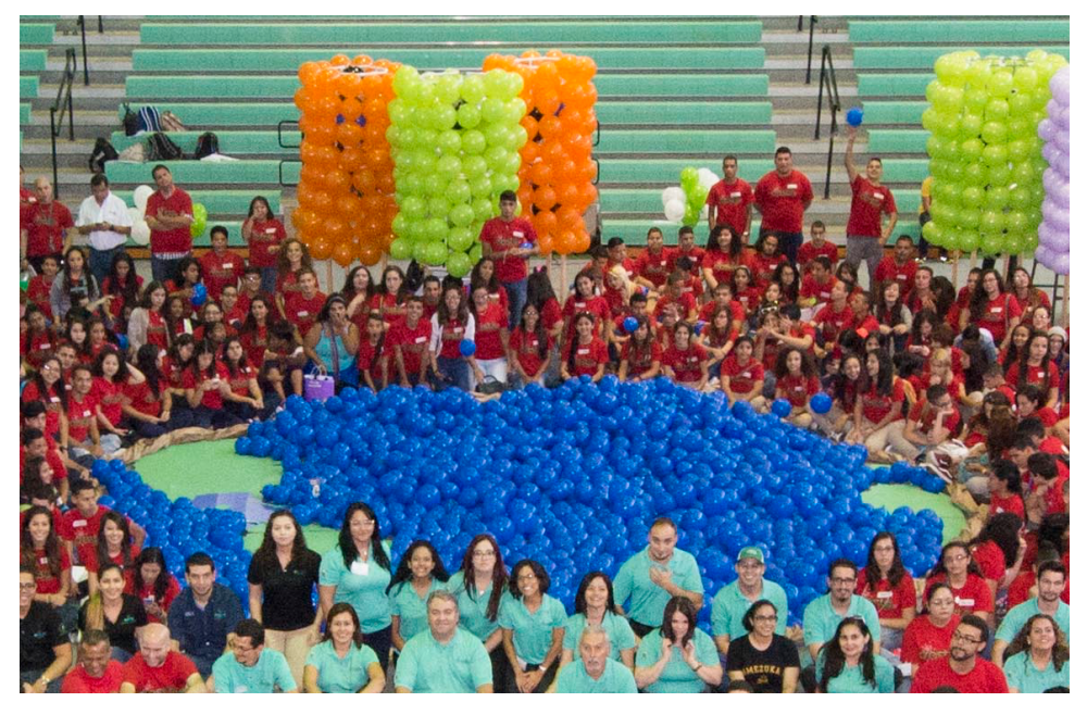
Figure 2b. 2015 Annual Club Meeting scientific model: "Emerging Contaminants in Water."