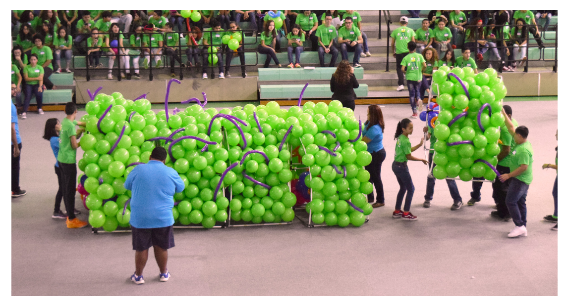
Figure 2c. 2016 Annual Club Meeting scientific model: "Light and Nano-Biomedicine: Preventing Human Diseases."