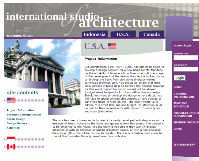
Figure 2: Indonesian International Studio Web Site Note. From http://www.archiplan-ugm.org/isa_intl.asp January, 2004

As this project progressed, the instructor quickly came to realize that it would be extremely difficult to deliver three different lectures to the class on each topic that was traditionally delivered through one lecture. What complicated the project even more was that the Indonesian project did not use wood frame techniques and required a whole new set of lectures and construction techniques that the instructor only became aware of as the information streamed in. Often students received the information before the instructor as they were empowered with the gate-keeping of information.