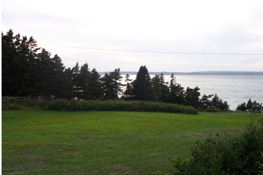
Figure 4: Canadian Site Picture Source Note. From: College of the North Atlantic

technical design concepts often had to be imagined (modeled, Archer 5 ) and presented through drawings during the job meetings. These often occurred “on the fly” and the students got to see the instructor (or other students) designing and making critical decisions on the spot, much like would take place within a job meeting in industry. This also allowed the instructor to use techniques such as mental mapping (Hart, Wil & Bradford 6 ) and experiential types of learning (Kolb 7 ) that have been noted as being successful methods to engage adult learners (e.g. Scherf 8 ) in imaging problems.