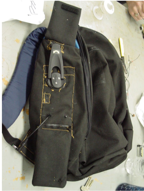
Fig. 1: Overall back pack on student. Fig. 2: Back pack flap open to show crank