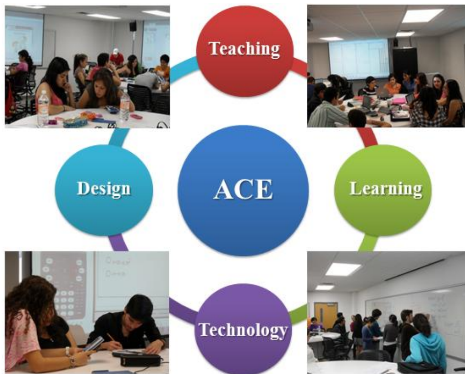
Figure 2. Images of the ACE classroom showing students working in activities during the implementation of teaching strategies using some of the available equipment.

The ACE classroom was funded by internal resources from both the Research Chair in Physics Innovation and Research and the University President; and external support granted by Hewlett-Packard through their HP Innovations in Education project. This company provided much of the equipment of the room, and the University remodeled the space and provided the rest of the equipment. Instructors have invested a great deal of time in developing activities and pilot studies to determine the impact of the classroom on their courses. Figure 2 shows images of the environment of the ACE classroom.