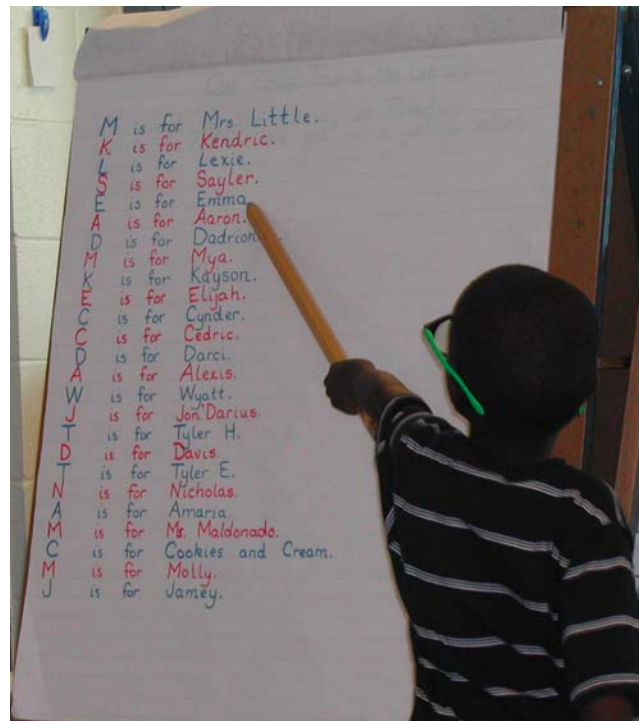
Figure 4. Kindergarten child CHECKS class predictable writing for punctuation element.

As with the engineering aspects of using the Jamerson Design Process, the SHARE stage here is critical as well. Students are required to communicate their work with their peers. They not only read their piece, but share what elements of good writing they included and how they might improve on their writing. In these activities, students become teachers for their classmates as they learn about each other's strengths and weaknesses as well as see how peers use skills learned in class.