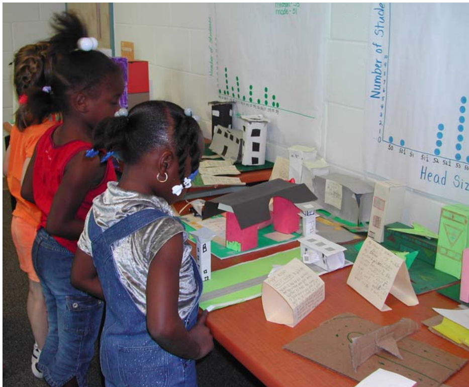
Figure 3. Kindergarten students observe the fourth graders' polygon airports and airplanes during Jamerson Expo.