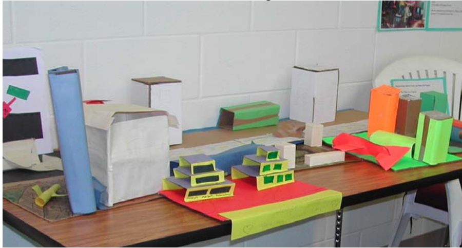
Figure 2. Some examples of fourth grade design challenge for airplanes and airports made with polygons.

use to complete the project. For the DESIGN stage, the fourth graders each sketched their airplane and airport and then built their towers, terminal and airplanes. The students were given questions, such as “Did you change your original design?” and “If you changed your design, what problems did you have that made you change your design?” to help them CHECK their designs. Then they were directed to list any changes they would like to make if they were to make another similar project. In the SHARE stage, the students were asked to prepare a three minute presentation of their design concept and how their final product reflects the design challenge. Although the polygon airports and airplanes looked very different as shown in the photographs below, each followed the Jamerson Design Process.