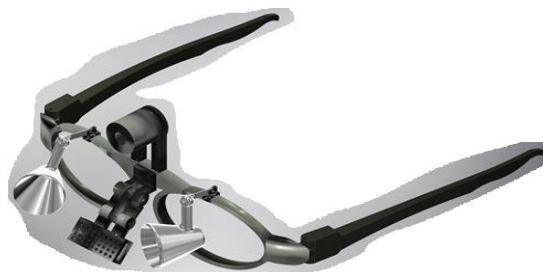
Figure 3: Loupes designed by students

The average cost of a loupe, extensively used by medical practitioners, is $300. The task for second year students is to improve the design and reduce the cost. This task made students think in a different way. They have to analyze all details including manufacturing cost, materials, cost-effective design, and mechanical strength. Designing loupes is challenging and requires high skills in modeling. The initial cost estimate is $150 dollars