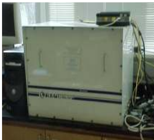
Figure 3: Faraday Cage with cover on.