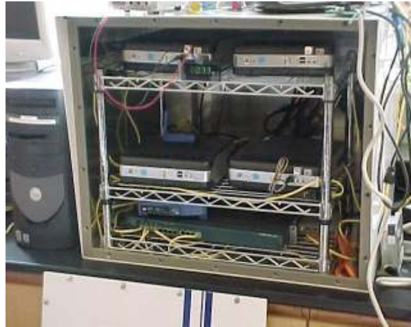
Figure 4: Faraday Cage with cover off.

Remote portal operation consists of a firewall 5 , student reservation system, and access to pod devices. This section describes remote portal operation and student access.