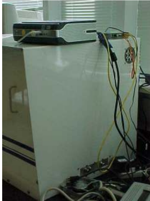
Figure 2: Faraday Cage side showing waveguide opening at the upper right hand corner.

One converter receives network traffic from the network 10Base-T port and converts the traffic to light signals. The light signals are transmitted across SC/ST fiber optic cables to the other converter, where the signals are converted back to electronic form and sent through a 10Base-T port to the destination network. Figures 3 and 4 show the faraday cage with the cover on and off.