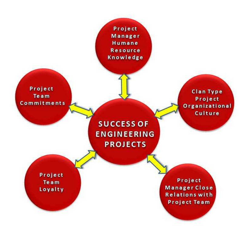
Figure No. 2 Model for the Success of Engineering Projects.

From the results of this research, a model is developed for the success of engineering projects as shown in figure number 2.