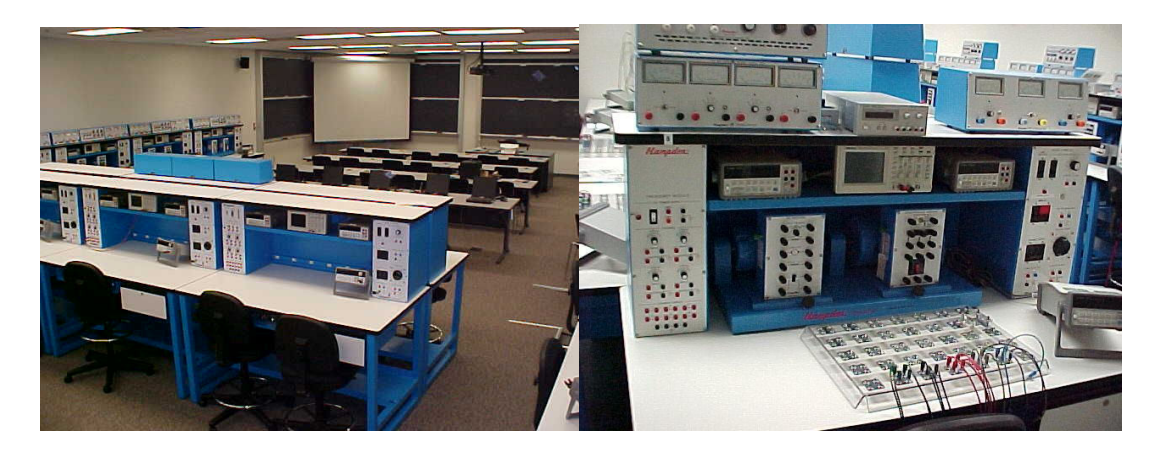
Figure 1: Studio Classroom Laboratory and Populated Laboratory Bench

The first course is an electrical circuit analysis and power course. Power is a vital subject for officers who will be assigned to Navy ships and submarines. The initial course topic is basic DC circuit theory. Students learn DC resistor based circuit concepts that include voltage and current divider and Thevenin's theorem. Instructors often use examples such as light bulbs and car batteries to help students relate the concepts to familiar items. The