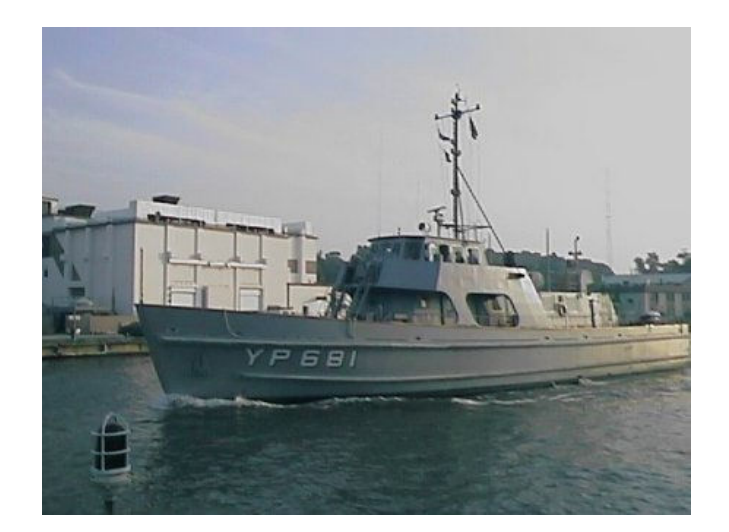
Figure 3: USNA Yard Patrol Craft

This circuits and power course is a prerequisite for the second course on communication systems, digital logic and computer networks. Simple filter design and the concepts of gain, attenuation, noise and frequency spectrum prepare students to study Amplitude Modulation (AM) and Frequency Modulation (FM) based communication systems. The practical exercise circuit in Figure 4 uses a summing operational amplifier coupled to signal and noise sources and a speaker to reinforce the concept of signal-to-noise ratio. Student use their oscilloscope skills to examine how different levels of noise interfere with both a sinusoidal signal and an iPod generated audio signal. An introduction to superheterodyne receivers gives students experience moving signals around the frequency spectrum and reinforces the concept of bandwidth.