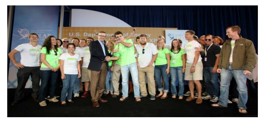
Figure 6. The team accepting the "3rd place in engineering" trophy