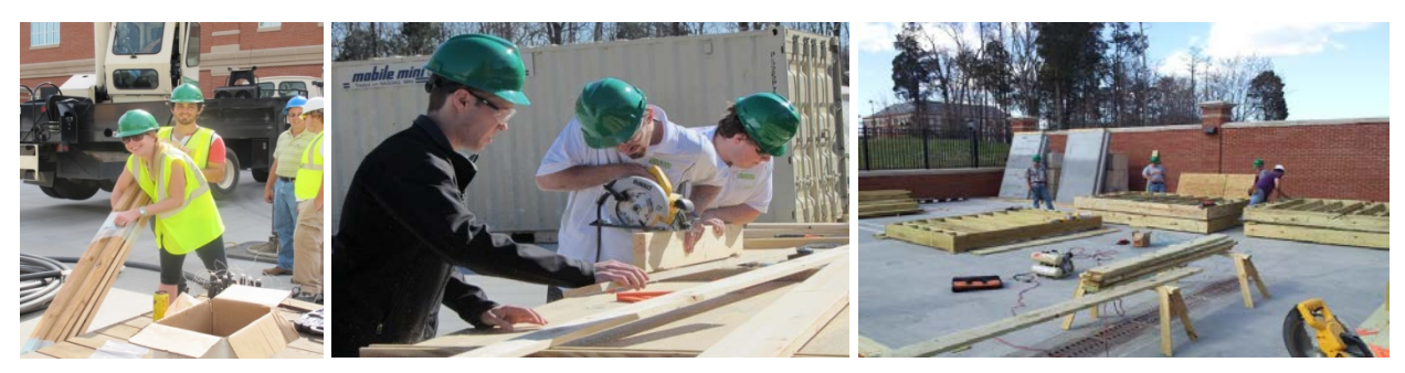
Figure 4. The team during house construction

Each WG had a student lead and a student liaison to other groups. Communications among the various WG as well as with the Architecture students was of paramount importance, as all the systems in the home are highly interdependent. A design decision on one system would affect the others. The student liaison was tasked with this important communicator and exchanger of information role. In support of a smooth sharing of information, the course also regularly met with a corresponding studio class in architecture. During this construction phase, the students also obtained safety training. Figure 4 below shows pictures of a group of students working on the house construction.