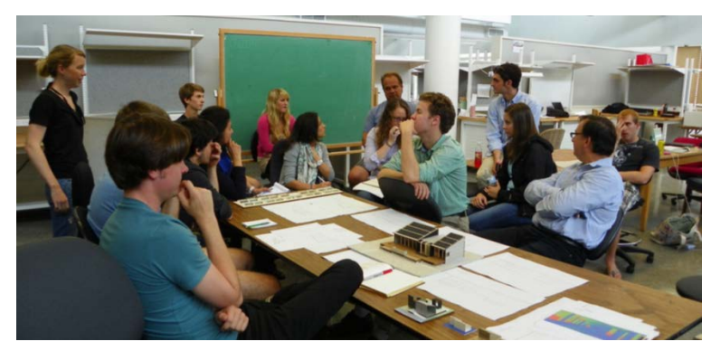
Figure 3. Team brainstorming session during the Schematic Design Phase