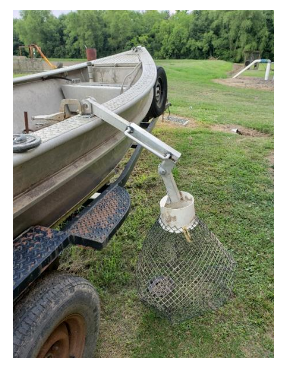
Figure 1. Trap Lifter on Boat

farmers could quickly use the mechanism efficiently. The farmers would need to see a quick return on their investments like a reduction in soreness that is currently felt daily. The assembly to their boats needed to be simple so they do not have to modify their existing equipment too much. Simple mechanical parts with no hydraulic, pneumatic, or electronic components minimized break down issues of the mechanism. The material required for the mechanism had to be light weight not to add too much extra weight in the boat which could cause unnecessary wear and tear on the boats' motors and to the ponds. Extra weight in the boat would cause deeper ruts in the ponds and in turn cost the farmer more money after the season to rework his pond<sup>6</sup>. The material also could not cause damage to the traps. The mechanism needed to mount and operate in a way that would not be intrusive to the farmers' work of emptying the trap, rebaiting it, and replacing it into the water. The design process included research, interviews, analyzing concepts to determine the best design, building and testing the prototype, and analyzing data collected.