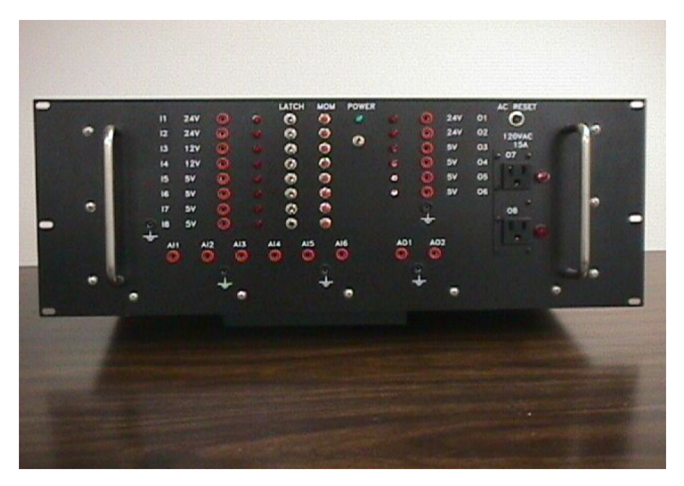
Figure 1: The faceplate of the trainer

designed using AutoCAD. A careful consideration is given to placement of all holes and marking on the faceplate of the unit. The AutoCAD drawing was also used to create a silk screen for printing the markings on the faceplate. The faceplate is designed in such a way that all switches, jacks, indicators, and inputs are placed on the left and all outputs are located on the right of the front panel. Figure 1 shows the faceplate of the trainer. On the bottom panel of the enclosure some holes were added to aid mounting the 24^{V} DC and 5^{V} DC power supplies, the PLC, and the two relay boards.