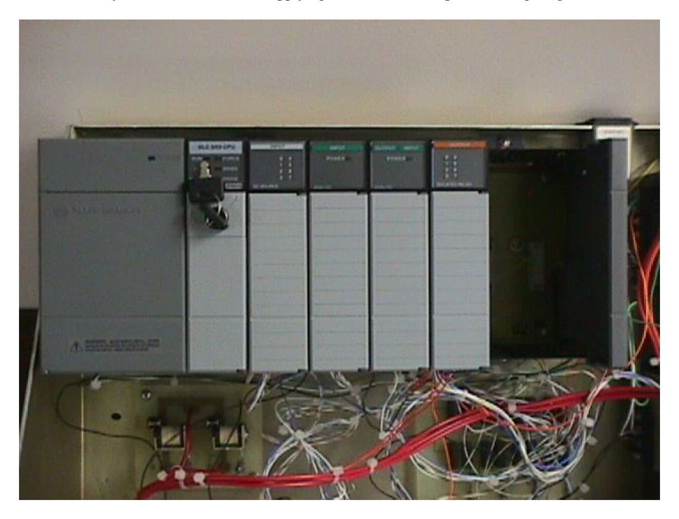
Figure 3: The trainer's modules