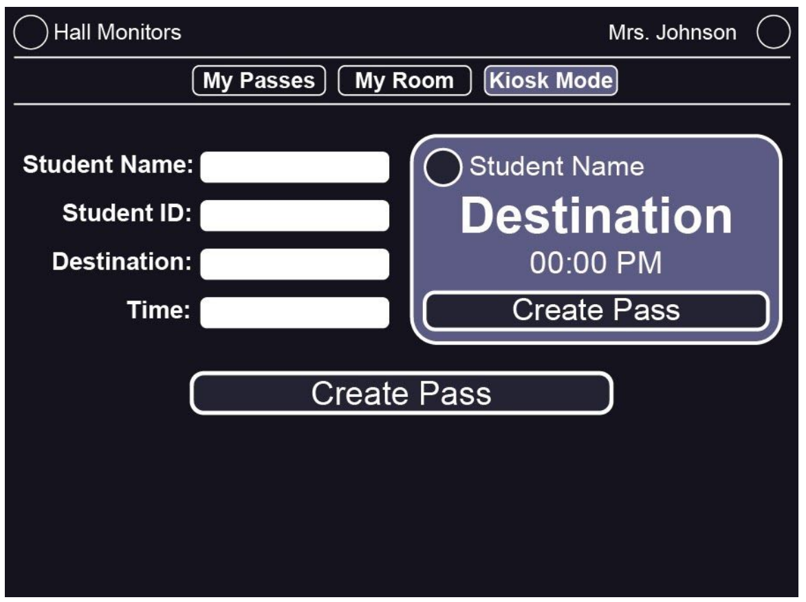
Figure 3: Kiosk Mode View

Lastly, users can navigate to a "Kiosk Mode" which will be for creating multiple passes (Figure 3). This page will be stuck on the pass creation page and allows teachers to create many passes at once without having to start the pass creation process from the beginning each time.