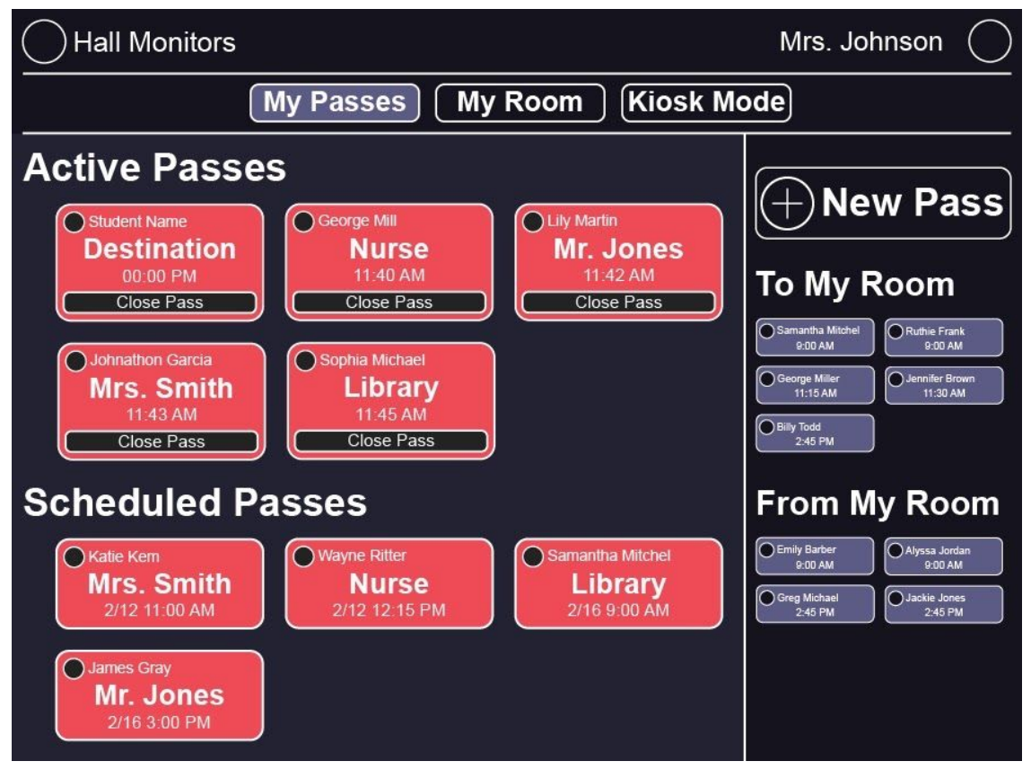
Figure 1: My Passes View

On the front end of this system will be the user interface being displayed through a web based application. To access this, staff will need to go to the web URL and login using their GSuite sign in. The user interface for the teachers will have a "My Passes" section as the homepage. In this section they can create new or future scheduled passes as well as see their active and scheduled passes (Figure 1) (Note: All names in Figures 1, 2, and 3 are examples, and are not based off of real people).