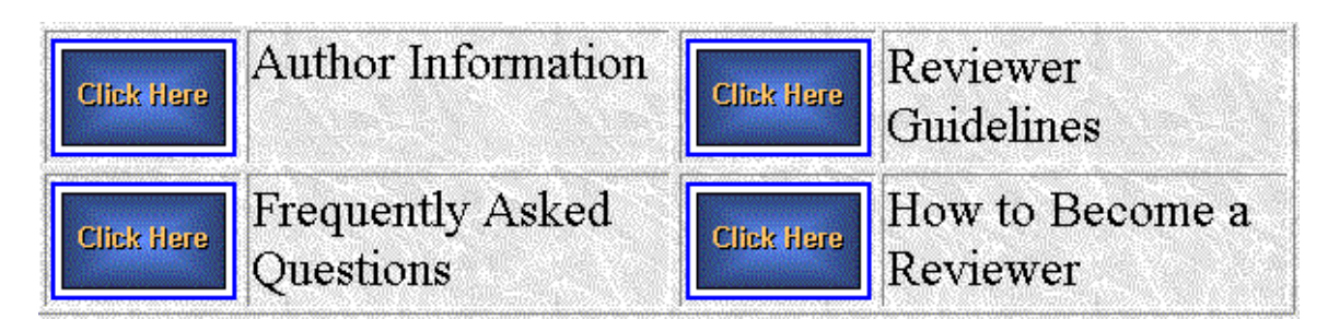
Fig. 5 On-line guidelines for the Technology Interface

The Technology Interface home page also provides a section for Author Information <sup>5</sup>, Frequently Asked Questions <sup>6</sup>, Reviewer Guidelines <sup>7</sup>, and How to Become a Reviewer <sup>8</sup> as shown in Fig. 5. Information regarding these topics can be browsed by clicking on the buttons.