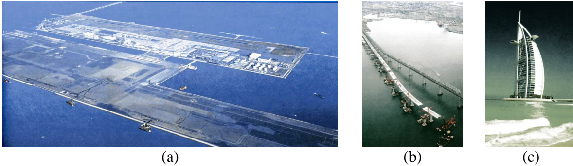
Figure 2. Sample of the construction projects highlighted at ICIC 2006. (a) Japan's Kansai International Airport; (b) the new San Francisco-Oakland Bay Bridge East Span; (c) Burj Al Arab in the United Arab Emirates

The conference program also included such topics as current issues affecting the construction industry, global construction insights, risk management and sustainability of global business partnerships, accelerated bridge construction technologies in the US, the construction industry in Egypt, Business opportunities in Iraq, the Czech Republic construction market, the China construction market, the Brazil construction market, sustainable building systems for the future, the asphalt revolution and world-wide innovations in materials, latest developments in construction automation technologies, and many other interesting topics. The conference also included two panel discussions; one panel discussion was to investigate and identify new world markets and the second was to discuss the world of ethics and on-line reverse auction bidding. The variety and wealth of topics in subject and source provided an unmatched opportunity for participating students and faculty to be more aware of what is going on in the world around them. It may be fairly easy to invite a speaker to class to talk about construction efforts in China, or in the Czech Republic, or in Japan, or in the United Arab Emirates, or anywhere else in the world. But to have decision makers from all those places available at once to talk about their particular regions is something that is quite unique and that was only possible because of the way ICIC was organized, planned, and executed.