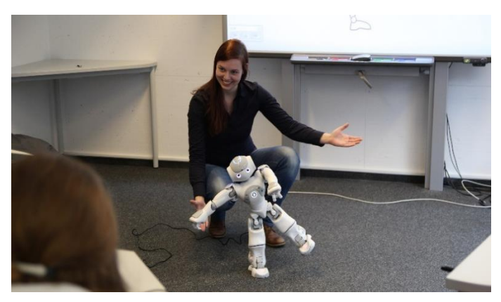
Fig. 6 - Experiment Supervisor explaining the balance principles of a NAO robot

Depending on age and physics knowledge, the course can be expanded to include calculations regarding the centre of mass, which in turn can be used to verify the results the students found at the earlier stage. Over the course of several experiments, it was found that the performance and speed of the students did not depend on their age or school system – even adults needed similar amounts of time to solve the problems. An analysis of the experiments is outlined in the following section.