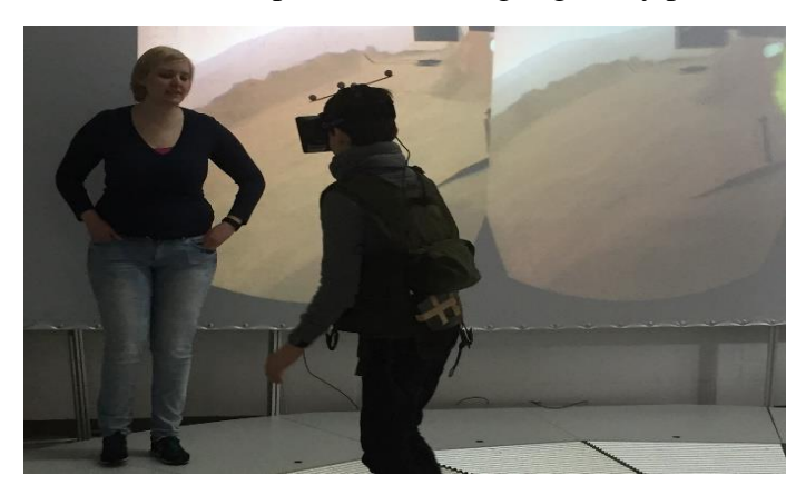
Fig. 2 - Student exploring the Mars Rover, an opportunity available in a virtual "Walk on Mars"

The main discussions will occur while the students are engaged with the holodeck. Within the virtual environment, students find models of autonomous vehicles that have been sent to Mars to search for water and signs of life. When a new probe is discovered, the student on the Holodeck describes it to the group and discussions are held about the possible functions of the components of the probe. A gallery of the most important facts is shown at the end in order to summarise the experiment and highlight key pieces of information.