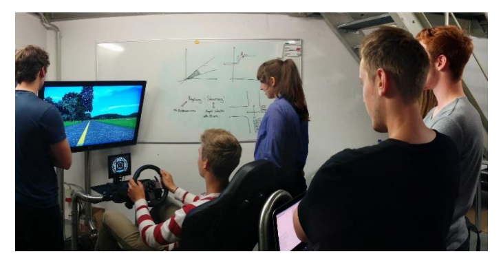
Fig. 4 - Students tuning control algorithms in a driving simulator

PID control (proportional-integral-derivative control) is also introduced in more detail. The age of the students and their knowledge of mathematics also determines whether the calculations behind the control loop should be introduced, or whether simply its behaviour is discussed. This new knowledge is put into practice in the following experiment that sees students attempting to manually follow a line on the road by turning the steering wheel, ultimately showing the challenges of following the line at high speeds. This is followed by a control loop guiding the lateral control of the virtual vehicle, whose PID is initially set to zero. The students experiment with the coefficients, the influence of the rate of proportionality and the differential or the integral gain. In doing so the students experience the oscillating, amplifying or compensating behaviour of the virtual car while following the line, whilst also analysing complex mathematical correlations and visual feedback from the driving simulator in a trial-and-error method. This method interweaves theory with practical experience and leads to an internalisation of learned knowledge, which is only improved upon by the fun and interesting knowledge acquisition method.