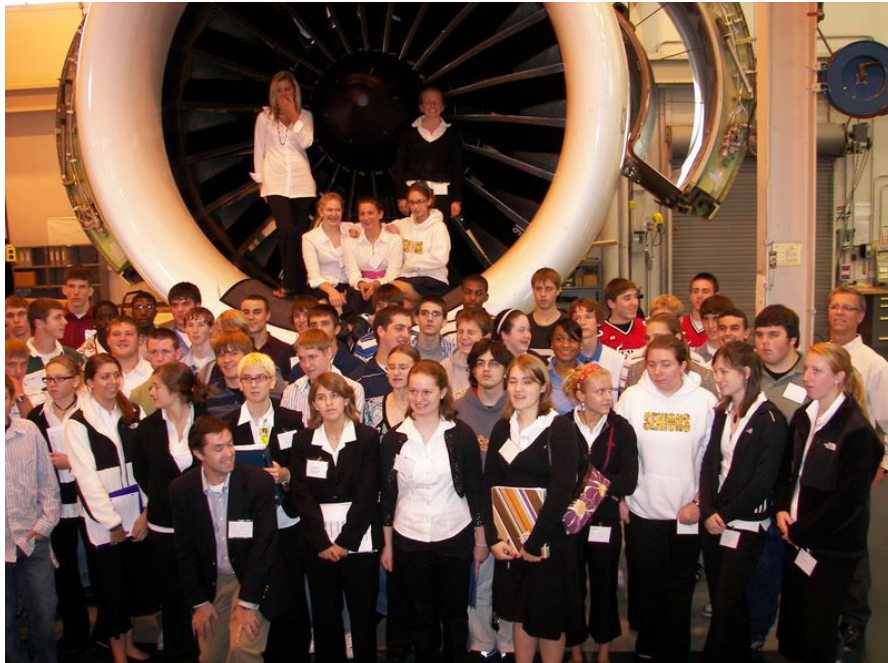
Figure 2 Students Visit GE Aircraft Engines

The collaborators continued to meet as the course was being presented. These meetings were valuable in identifying issues that needed to be addressed as well as providing formative assessment from the point of view of the instructors. The working group constructed a mechanism to capture lessons learned and best practices as the course was being offered.