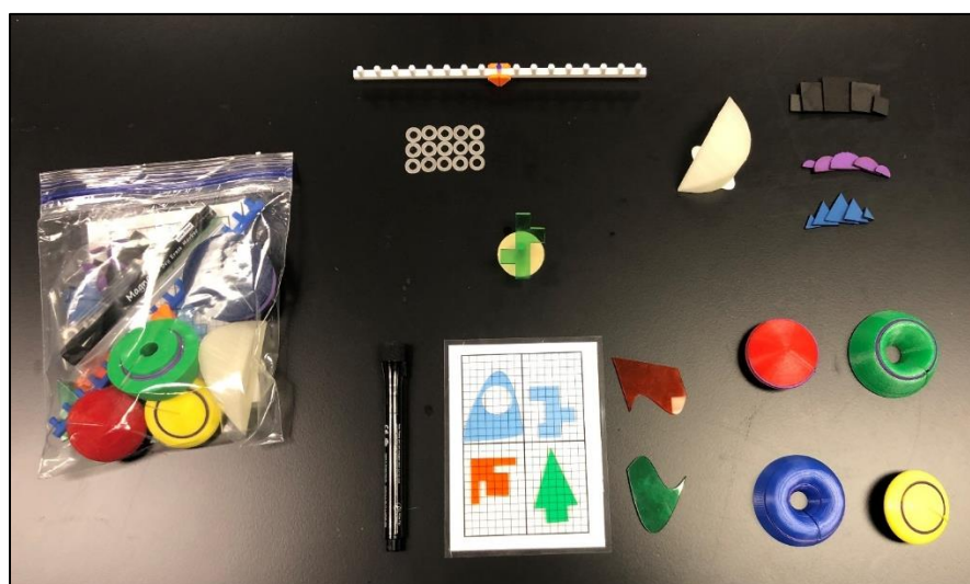
Figure 3. Take-home calculus model kit distributed to students in the intervention sections.

During 2019-20, the project team recruited math and engineering faculty from three other colleges to teach with the models starting Fall 2020. The goal of this expansion was to increase sample sizes and diversity for statistical analysis of classroom data and to learn about the experiences of the faculty as they integrated the curriculum materials into their own courses. The original vision was to kick off the expansion with a one day in-person workshop to introduce participating faculty to the models and curriculum. Then faculty would use the models in face-to-face instruction. The transition to online modality in response to the COVID-19 pandemic forced a rapid pivot during this expansion. We reported in [5] on our experience and student feedback results adapting the curriculum from a platform for collaborative active learning in the face-to-face classroom to individual remote learning at home. Figure 3 shows the kit that we provided to each student in the online sections in which the calculus models were used.