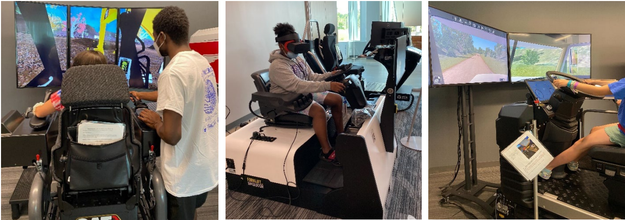
Figure 1. (Left) A participant been assisted through a lesson on the CAT Excavator Simulator, (Middle) Participant completing a Forklift Simulator lesson, (Right) Participant using the truck driving simulator to complete a custom skill task.

simulators. This module's time is dependent on the number of simulators available. For a group of 25 students with access to four simulators, the activity took approximately 40 minutes.