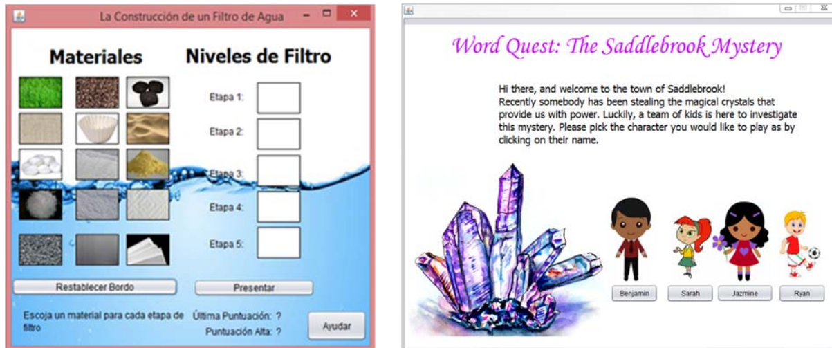
FIGURE 2. SCREEN IMAGES FROM WATER FILTRATION AND LANGUAGE CONVENTIONS APPLICATIONS.

To better illustrate what student teams have proven themselves capable of through the cornerstone design project, two software applications are briefly reviewed here; example screenshots from each application are presented in Figure 2.