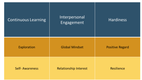
Figure 2. Frameworks to Assess Intercultural Development [19], [23]