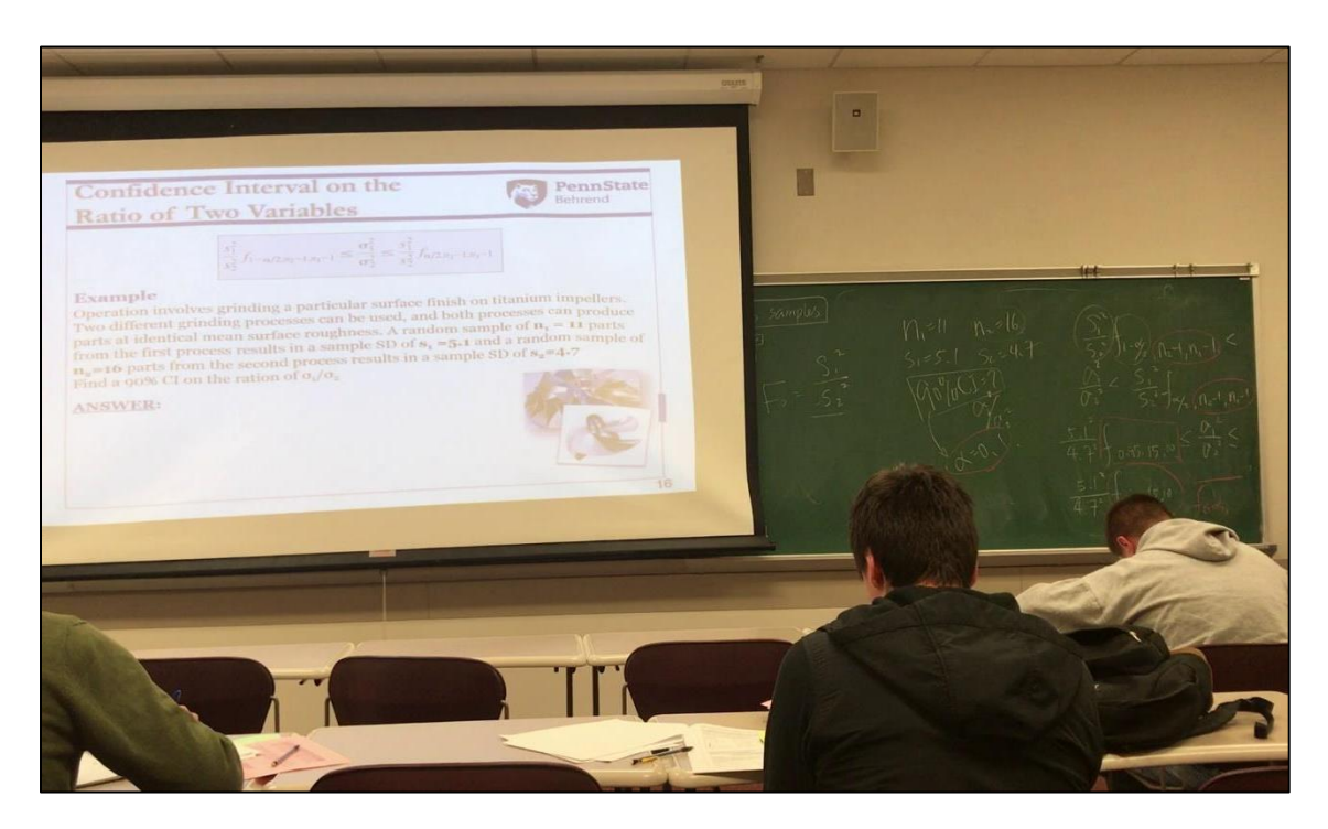
Figure 1. In-person class for confidence interval on the ratio of two variables. Chalkboard used in combination with projected PowerPoint slides on screen.

exams were 75-minute written exams taken during class time. Both the quizzes and the exams were closed-book and closed-notes evaluations.