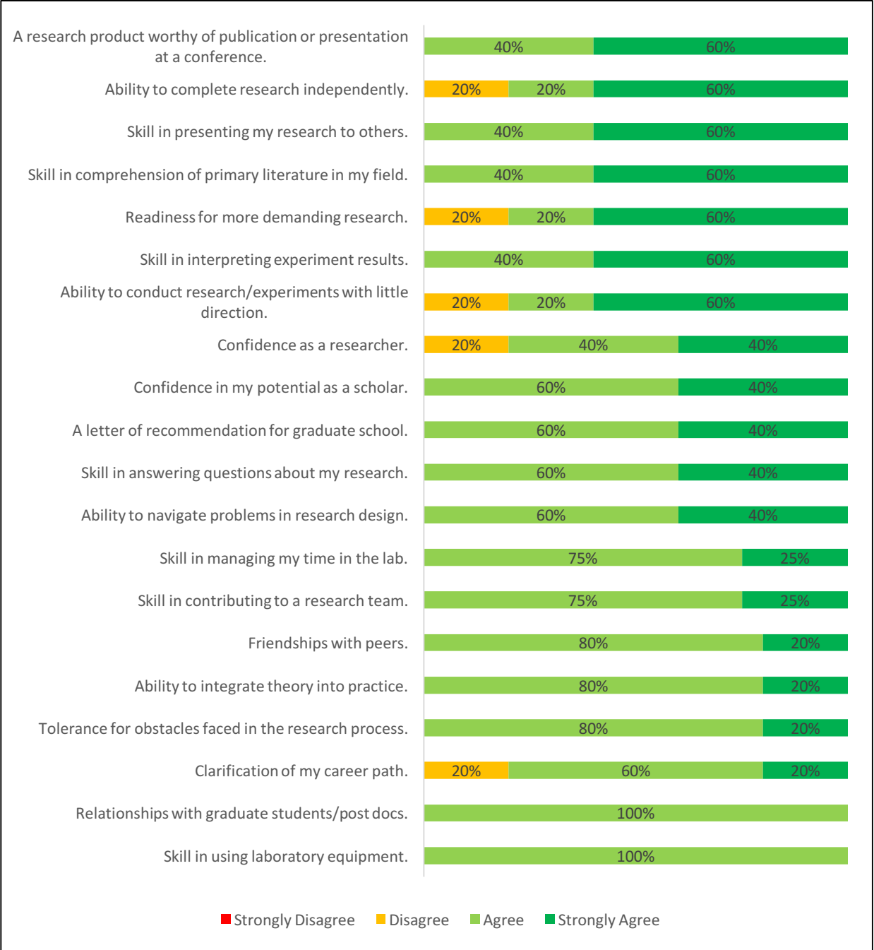
Figure 2 - What did you gain from attending the 2017 Nebraska Summer Research Program? (n=2~5)