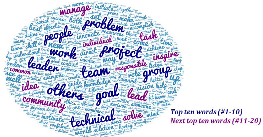
Figure 2. Word cloud visualizing the most commonly used words across the engineering leadership definitions.

From the surveys collected, 163 definitions were analyzed. Definitions contained a total of 4408 words, averaging 27 words with a range of 2 to 113 words. When coded, there were 689 codes total, with definitions averaging four codes, ranging from 1 to 15 codes each. A word cloud showing the most commonly used words in the definitions is shown in Figure 2.