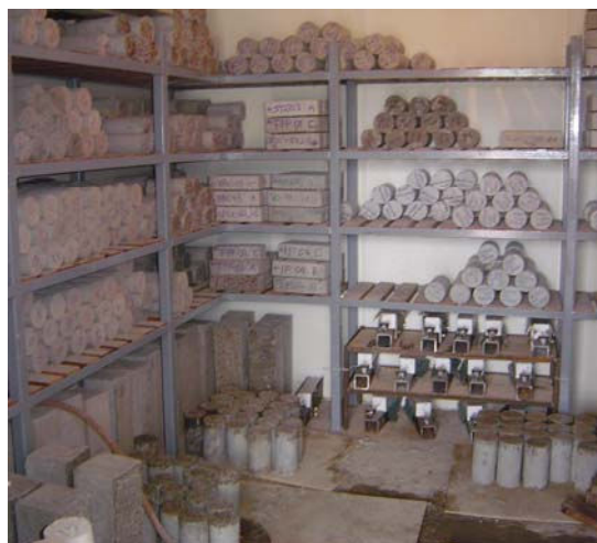
Figure 2 – New shelves in use

To further instill a sense of mission and urgency, each day of the first week was pre-planned with group meetings and work. The meeting topics included an orientation to the summer's goals, introduction to the research topics and instruction on completing literature reviews, creating a test matrix, planning work, keeping records of the research in a lab book and writing a research report. The work sessions included initial cleaning and organization of their work area, rebuilding several pieces of equipment, removing the old racking system from the environmental chamber and replacing it with a more efficient rack system built from raw materials and modifying a surplus table to serve as