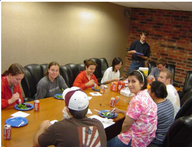
Figure 1 – Friday lunch in the conference room

Building a sense of community and avoiding feelings of drudgery were critical to the success of this endeavor. Besides helping to build community between the students, it was important that the leader was able to get to know each student individually. This helped to avoid students feeling that they were slave labor. From experience it was known that the lab would be extremely hot and humid during most of the summer. A social component was vital. It was decided that providing lunch, cooked and served by the faculty advisor, on Fridays might meet this need. While the menu was never complicated, pizza and hamburgers were never served. Figure 1 shows the students eating kabobs during the first Friday lunch of the summer. It was hoped that Friday lunch would help build the sense of community quickly and also that it would also send the message that the principle investigator was committed to and involved in both the research and the development of the students.