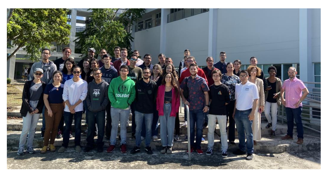
Figure 5: First cohort of RISE-UP students and the faculty team involved.