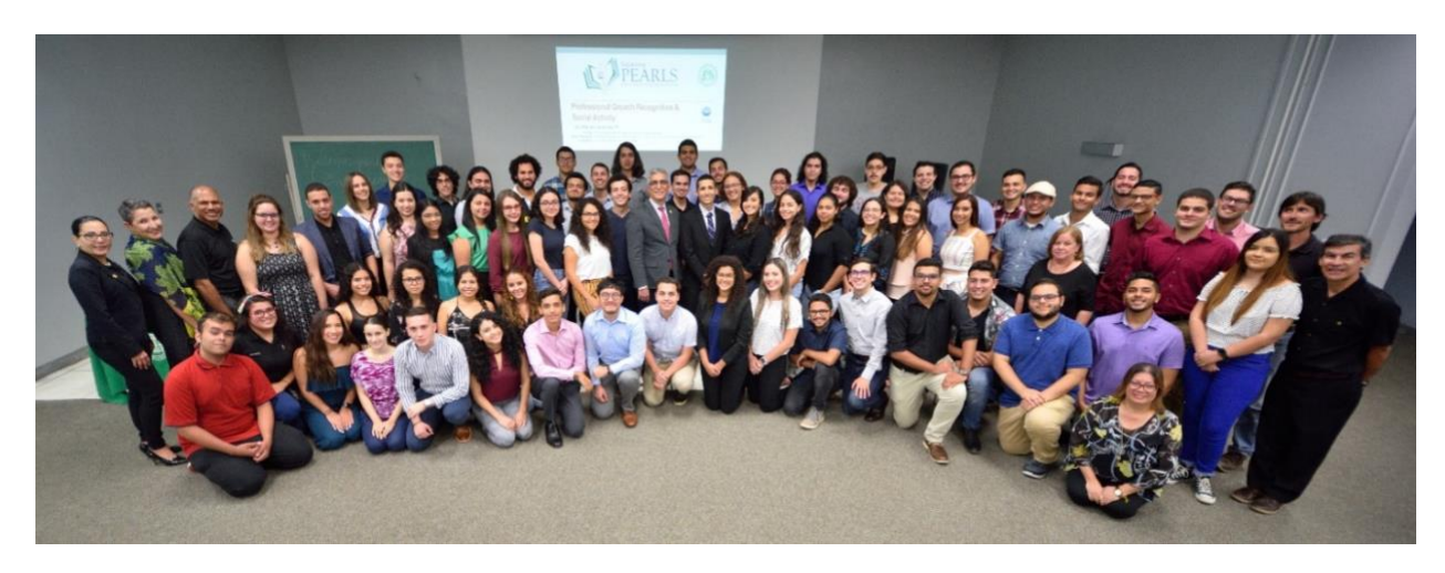
Figure 4: First cohort of PEARLS scholarship recipients and the faculty team involved.