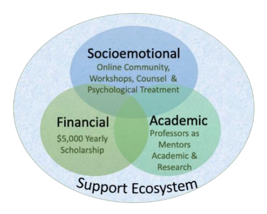
Figure 3: EECOS Support Ecosystem

the EECO scholars needed referrals to psychological counseling services, and 54% got involve in research. This project emphasizes the importance of developing and implementing an ecosystem of support that includes academic and socioemotional support systems, and the validity of the adage that financial aid alone cannot increase student success. Most outcomes for established goals have been reached, meeting or surpassing accomplishment levels indicated in the evaluation plan. For Goal 1, data shows that financial support has been provided consistently to support the Scholars to complete their degrees. In fact, during the first two years of the Project, twenty-one (21) Scholars finished their degrees and continued graduate studies or secured a job in STEM fields. For Goal 2 and Goal 3, the data show that they have not only received an academic and socio-emotional support that augmented their sense of belonging, but a synergistic effect that has increased the possibilities to continue in their programs, as well as has opened the doors in research and COOP practices.