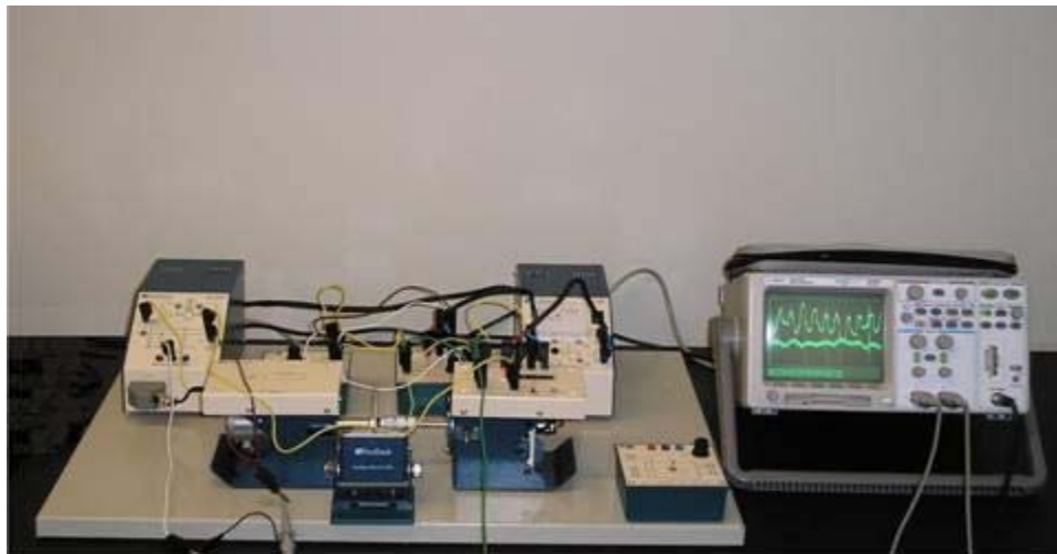
Figure 2. 150 Servo System Demonstration - V(t) Graph Display