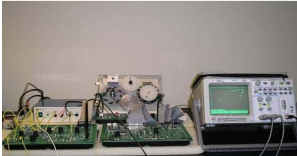
Figure 1. 33-100 Servo System Demonstration - (X-Y) Display