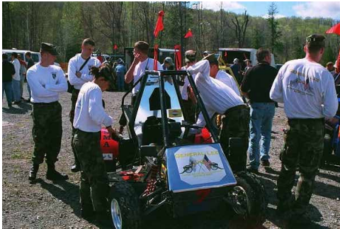
Figure 1. Vehicle Preparation

The United States Military Academy participated in the Mini Baja East competition for the first time in the summer of 1989. Since then, the team has competed every year for the past twelve years, with teams composed entirely of mechanical engineering majors.