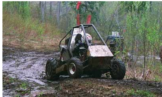
Figure 2. Endurance Competition

The competition requires students to “design and build a prototype of a four-wheel, single seat, off-road recreational vehicle intended for sale to the non-professional weekend off-road enthusiast.” [2] (See Figures 1 and 2, above) The competition requires the submission of a design report and a cost report. Static judging includes scores for engineering design and penalties for safety violations. Dynamic events include Acceleration, Top Speed, Braking; Land Maneuverability; Deep Water Maneuverability; Power Pull; Suspension and Traction; and an Endurance Race.