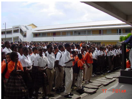
Figure 3: An Assembly of School Children in St Kitts.

In 1983, the Island gained its independence from Great Britain but remains a member of the Commonwealth. The spoken language is a formal English spoken very quickly with words often slurred together leaving most students believing the language is foreign. The inhabitants use their language to maintaining their identity. Understanding the language forces teams to focus their attention on what the people are saying, reading both language and body language.