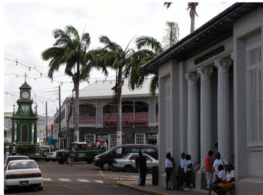
Figure 7: The Multi-cultural Influence Characteristic of Basseterre.

St Kitts has several attributes that make it an ideal site for our International (EPICS) program. Students observe wilderness, agriculture, industry, and tourism within the boundaries of a small site. They experience the language of the people and become a part of the local community of Basseterre (Figure 7), which influence their decision-making processes with respect to their design projects. Rituals, both local and international, influence the changes proposed through their design efforts. A combination of engineering design and a culturally diverse setting challenges our second year students and broadens the scope of their engineering skills.