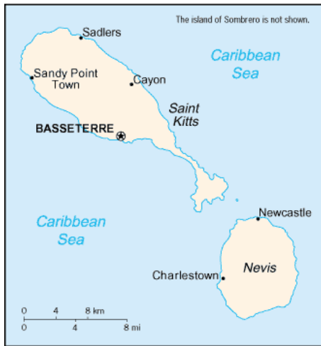
Figure 2: Map of St Kitts/Nevis

The Island of St Kitts/Nevis sets many of the physical boundaries or specifications for the engineering problems. St Kitts is an island of about 70 mi 2 and is the larger island of the two-island nation of St. Kitts and Nevis, illustrated in Figure 2. The Island is small but diversified.