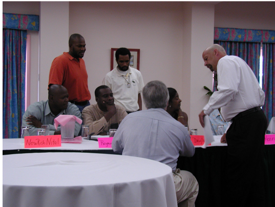
Figure 6: A CSM Student Presenting His Results to a Panel of Officials from St Kitts.

The formality of professional presentations reflects British rituals of intensification. Students present their work to members of government and local industry, illustrated in Figure 6, indicative of the value these people put on oral communications between client and consultant. Students learn through practice how to use their communications skills to market their solutions. Dress that includes shoes for men and no bare shoulders or midriffs for women attests to the formality but also to the value of the presentation. Presentation rituals emphasize appearance to highlight the importance of the content.