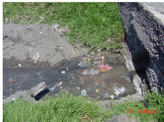
Figure 5: Contaminated Water Entering the Basseterre Harbor.

Many rituals exist around the natural medicinal powers of island plants and their ability to heal almost any affliction. The people take great pride in the multitude of plants that grow on the island. They place a great deal of value on the availability and quality of their water, and yet they throw their garbage into waters that flow to the harbor. They believe, as their ancestors did, that the ocean takes care of the garbage and cleans itself. Our teams observe the need to remove pathogens, phosphates, and garbage, shown in Figure 5, from waters discharged to the harbor in order to make the waters safe for swimmers and attractive to tourists. Since most tourists first see the harbor as the cruise ships approach the island, it influences their decisions to visit Basseterre. Our teams explore water issues that threaten the natural resources, the health of the people and the needs of the tourist industry.