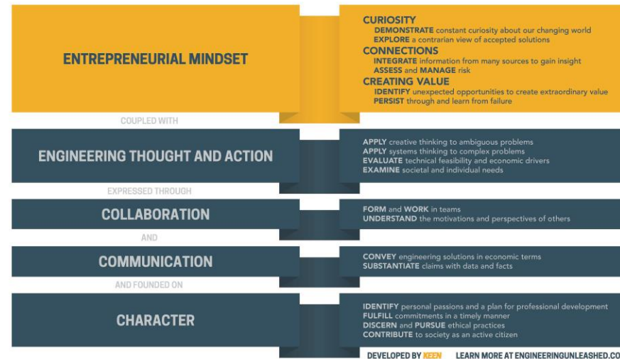
Figure 1. Conceptual Summary of Entrepreneurial Mindset (1)