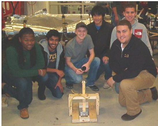
Figure 2: Tennis Ball Launcher project in Freshman Design I

In the freshman year, the original two-credit Freshman Experience course changed to one credit Freshman Design I and three credit Freshman Design II courses. The major design project originally implemented within the Design I course, an air-powered steam engine shown in Figure 1a, moved to the Design II course, while a simpler team-implemented design-build-test project is a part of the Design I course (Figure 2). The freshman sequence change implementation was achieved with one transitional semester where students who had the prior two-credit Design I class took a one-time three-credit Design II class; after that a few students did have a slightly redundant experience with the steam engine project in both of their freshman design classes (the old Design I and the new Design II), however they were encouraged to assist their classmates since they were “experienced”.