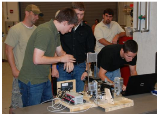
Figure 3: Steam Engine Tester project in Sophomore Design

Our pedagogical philosophy has been that students at this level need to develop the ability to integrate engineering science skills into the design process, to fabricate and automate increasingly complex devices based on specifications that the students generate, and to function on teams. In the original delivery, Sophomore Design course students built their own design-build-test project devices, and then worked on a team for a more complex design-only project. Economies of effort and demand for the student/faculty/facilities have been realized by removing the design-only project from the course and elevating the expectations of the design and build project, and making it a team project (Figure 3).