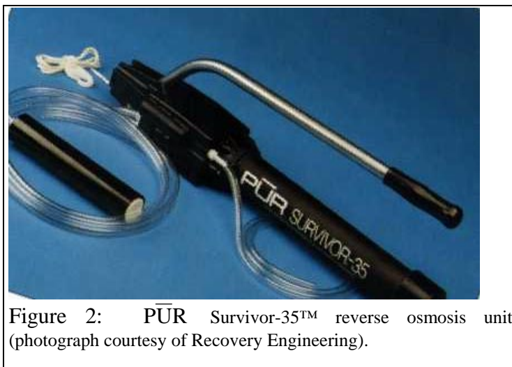
Figure 2: PÜR Survivor-35 ™ reverse osmosis unit (photograph courtesy of Recovery Engineering).

The Survivor units incorporate a spiral wound membrane into a small pressure housing. The spiral wound is one of several membrane module designs, i.e. , plate and frame, tubular, hollow fiber and spiral wound, which are shown to students as part of the demonstration. Students get an understanding for how this design configuration allows a large amount of membrane area to be contained in a relatively small volume thus accommodating a hand-held device.