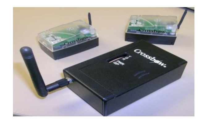
Figure 1. Starter Kit (two wireless nodes and one base station)

The wireless sensor Starter Kit is made for indoor usage and, by default, is programmed to operate in high power mode. The starter kit sensor nodes can use either a high or low XMesh power mode. Both modes provide true mesh network and the ability for every node to route data for other nodes. High power mode uses high bandwidth and sets the radio always "on." On the other hand, the low power mode uses low bandwidth and enables sleeping mode<sup>9</sup>.