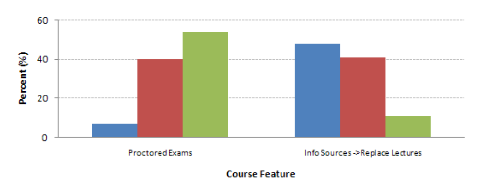
Figure 3: Student Perceptions of Course Instructional Features

Completely Agree Neutral Completely Disgree