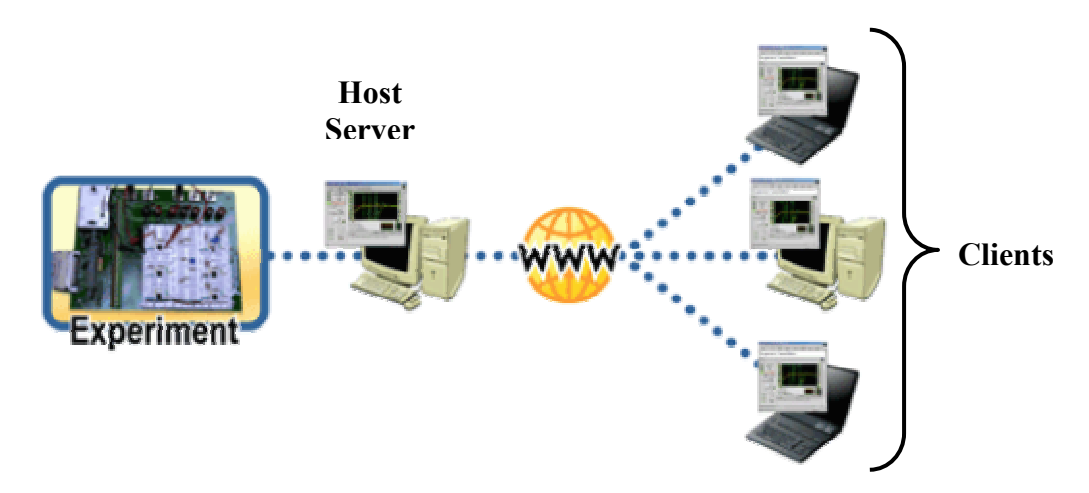
Figure 2. Remote control using LabVIEW

The user simply points the Web browser to the Web page associated with the application. When the user interface for the application shows up in the Web browser, then the application is fully accessible by the remote user. The acquisition occurs on the host computer, but the remote user has total control and identical application functionality. Other users can also point their Web browser to the same URL to monitor the application in progress. Only one client can control the