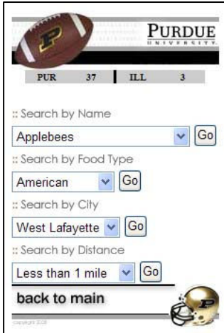
Figure 2. Restaurant Locator.

Included among e-Stadium's many application features are the restaurant and hotel locators. The e-stadium restaurant locator shown in Figure 2 allows users to search local restaurants by cuisine, restaurant name, city, or driving distance from Purdue's stadium. Each restaurant entry provides a business logo, address, telephone number, website URL, price guideline, driving distance from the stadium, and directions. For those football fans that have traveled to Purdue and plan on staying overnight, the e-Stadium application provides a hotel locator to help them find ideal hotels by hotel name, city or driving distance from the stadium. Each hotel entry provides similar information to the restaurant entries, while both utilize MapQuest.com to acquire driving distances and dynamically generated maps to specific locations.