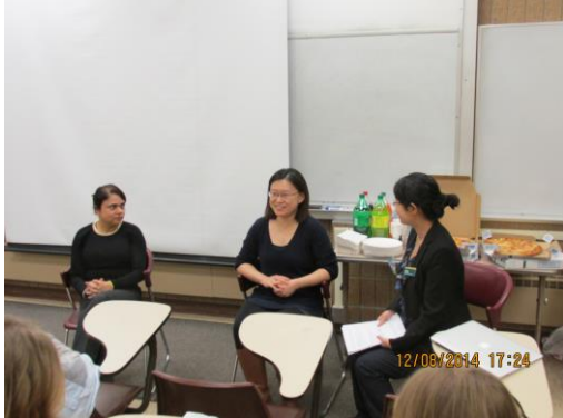
Girls met female professors in engineering