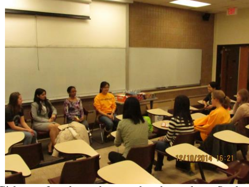
Girls met female graduate and undergraduate Students