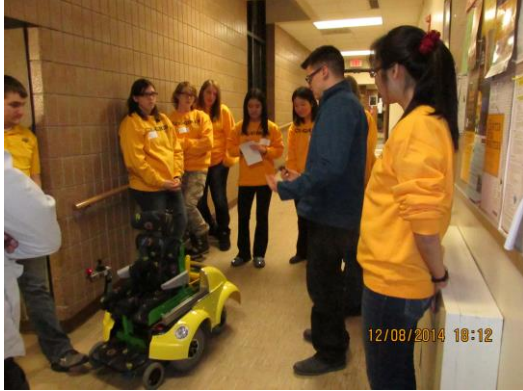
NDSU ECE senior design groups met the girls