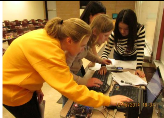
Girls were playing their implemented FPGA piano