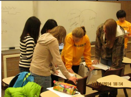
Girls were working on the FPGA piano project