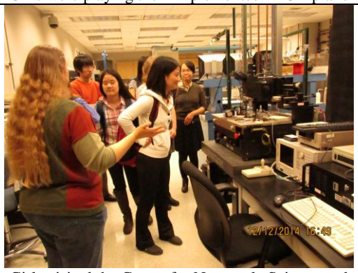
Girls visited the Center for Nanoscale Science and Engineering (CNSE)