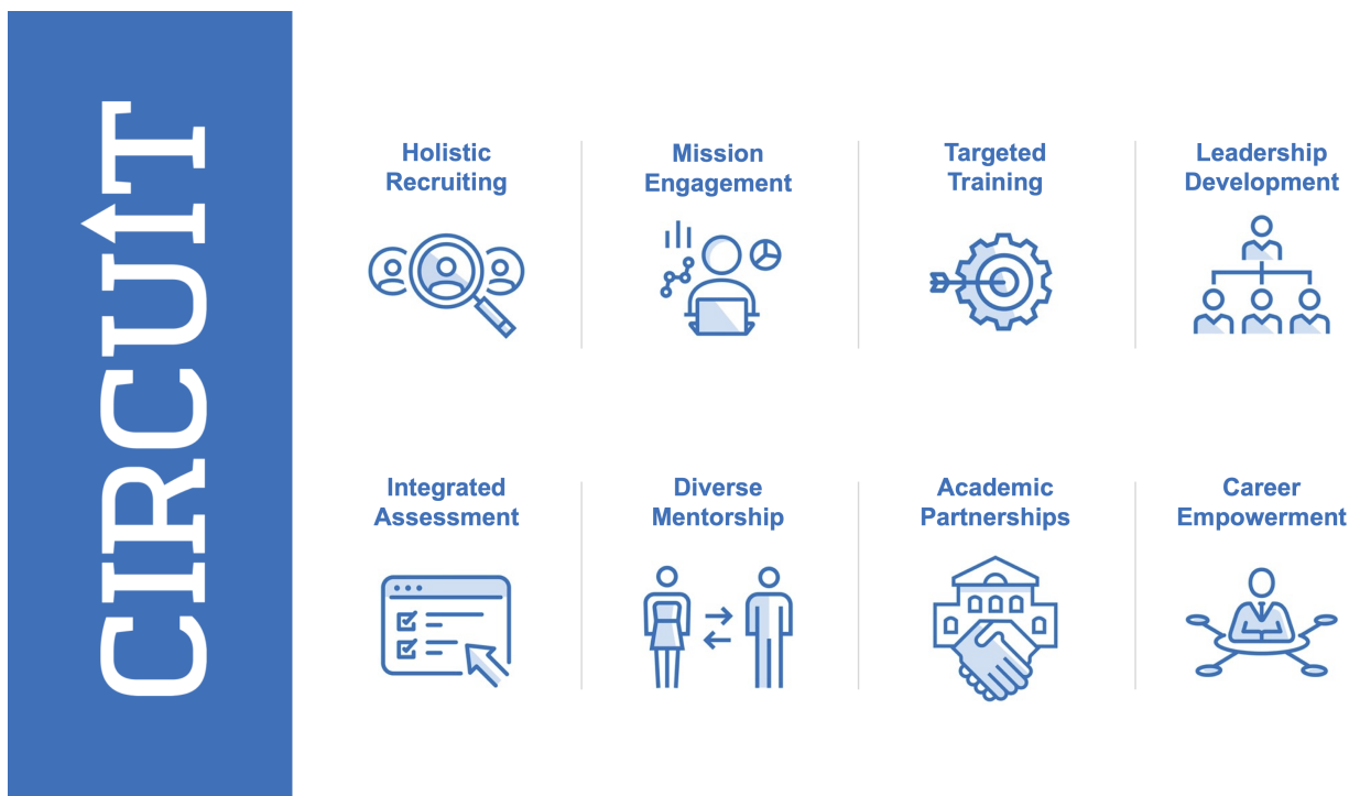
Figure 1: The 8 pillars upon which the CIRCUIT program is built. Each pillar has been chosen to address specific aspects contributing to the barriers facing trailblazing students in STEM and to encourage student retention and transition to the STEM workforce.

nical and professional development of our student fellows (Figure 1). This program is supported by our organization, The Johns Hopkins University Applied Physics Laboratory (JHU/APL), as well as by several university partners. We present the CIRCUIT program as a model method of increasing diversity in both recruitment and retention in STEM as well as increasing the quantity and quality of the STEM workforce overall 3,4 .