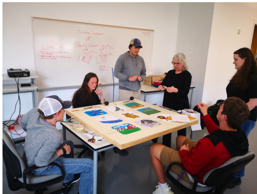
Figure 4 – Students & Faculty Working on the Farm Project

Meanwhile, the engineering and art students explore ideas to build their own set of projects that incorporate the Touchboard usage. The art students are more focused on artistic designs, while the engineering students are more focused on adding other actuators such as LEDs and motors.