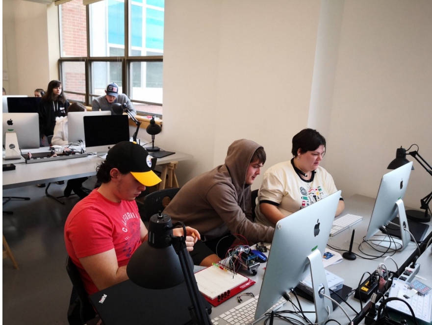
Figure 3 – Students Working together with Farm Clients