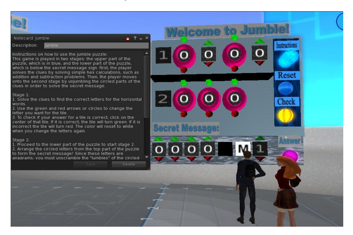
Figure 6. The Word Jumble.