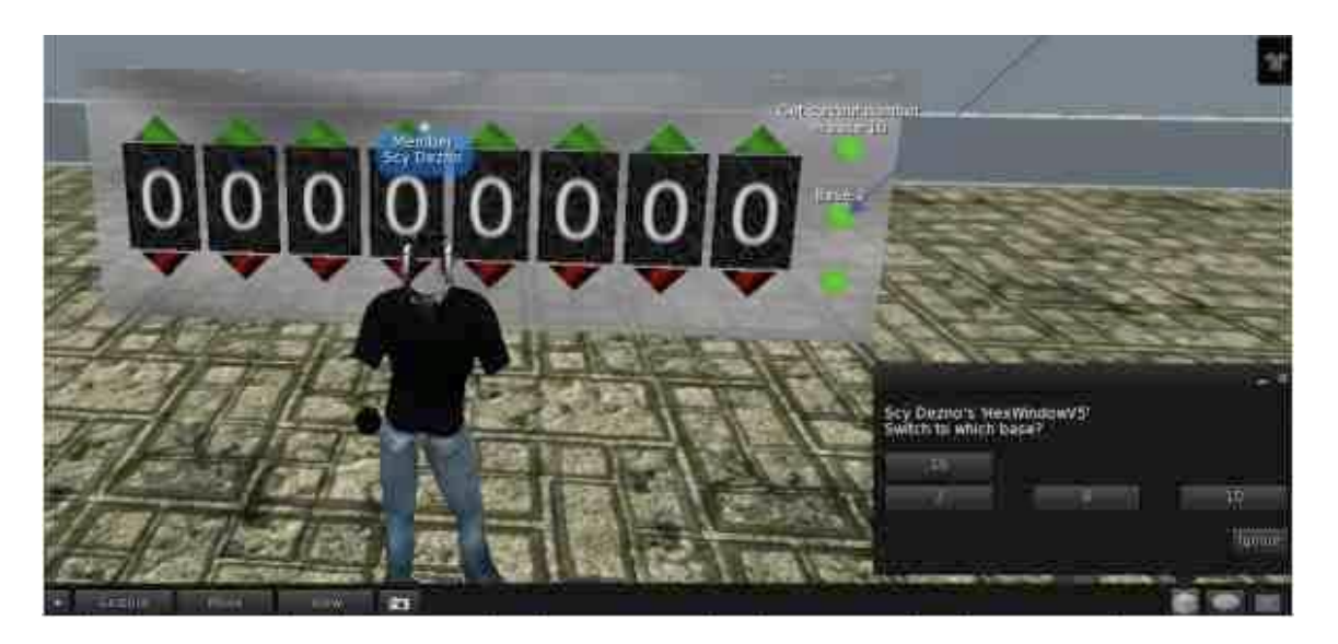
Figure 3. The HexWindow for learning positional numbering systems.

Buttons to the side of the panels allow students to switch between bases (converting the currently displayed value when possible), output the displayed value in base 10, and turn on and off carrying between number panels. After working with the HexWindow, students are directed to a Conversion Lock exercise, shown in Figure 4, whose functionality is similar to the HexWindow but designed to act much like a combination lock. To õopenö the lock, students must convert a number provided with the lock to an equivalent number in a different base (specified by the lock) to obtain the correct combination. When the combination is entered, the lock opens and the students receive rewards, such as VESLL t-shirts for their visitars to wear.