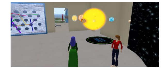
Figure 1. Virtual logic and conversion activities.