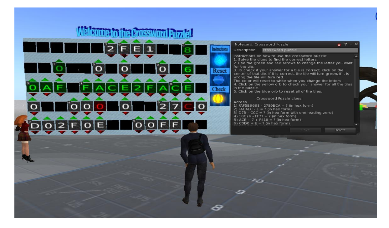
Figure 5. The Crossword Puzzle.

their answers or reset the puzzle, as shown in Figure 5. Figure 6 shows a word jumble activity that works in a similar fashion.