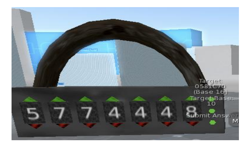
Figure 4. The Conversion Lock exercise.

Buttons to the side of the panels allow students to switch between bases (converting the currently displayed value when possible), output the displayed value in base 10, and turn on and off carrying between number panels. After working with the HexWindow, students are directed to a Conversion Lock exercise, shown in Figure 4, whose functionality is similar to the HexWindow but designed to act much like a combination lock. To õopenö the lock, students must convert a number provided with the lock to an equivalent number in a different base (specified by the lock) to obtain the correct combination. When the combination is entered, the lock opens and the students receive rewards, such as VESLL t-shirts for their visitars to wear.