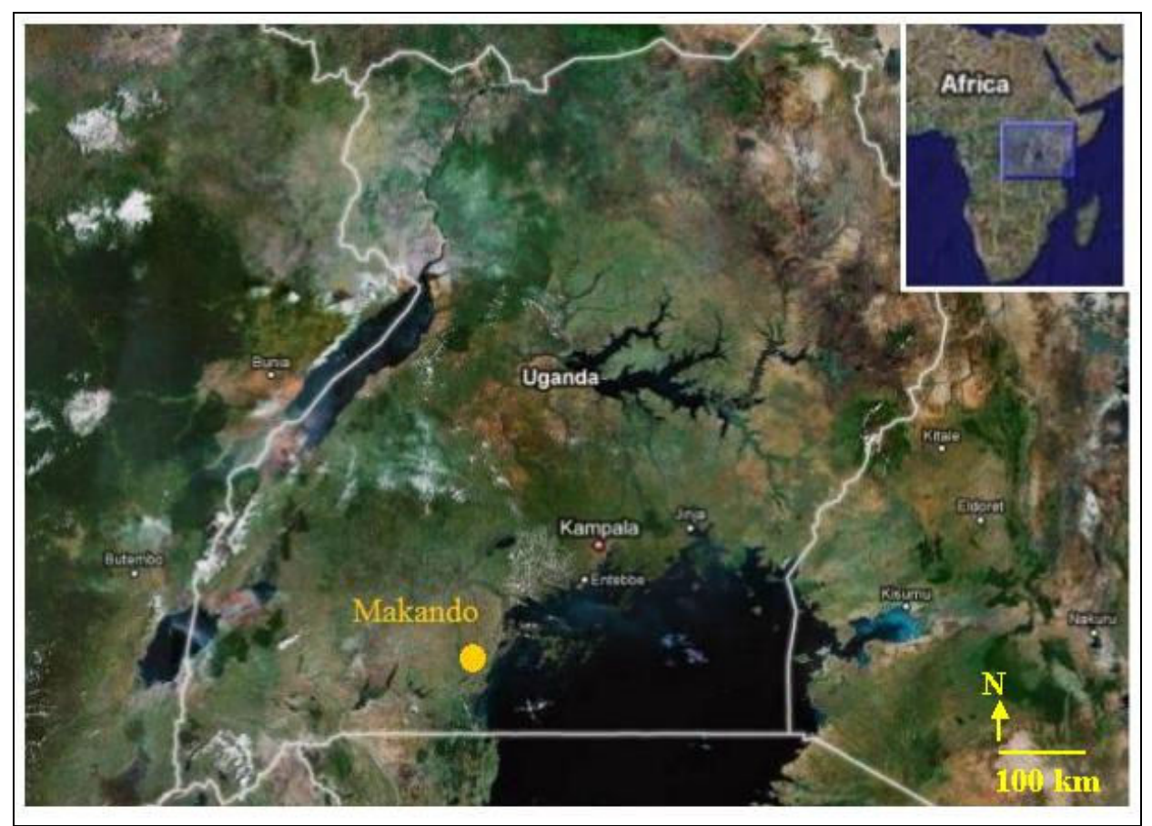
Figure 1. Location map of the rural city of Makando in the Masaka district of Uganda, Africa. Note: St. Denis Secondary School is located in the bush near Makando.

Education in Uganda is modeled after British 7-4-2 school system in which a student of age seven begins seven years of primary education, progresses to four years of secondary school, and may continue to two years of high school<sup>9</sup>. Secondary school is considered Ordinary level (O-level) education; high school is considered Advanced level (A-level) education. St. Denis is classified as an O-level institution but is beginning to offer several subjects taught at A-level capacity. A student concluding their fourth year of secondary school may select to complete the Ugandan Certificate of Education (UCE) exam. Students who earn an A-level score on the UCE are permitted to continue to high school. Students who successfully complete two years of high school and pass the Ugandan Advanced Certificate of Education (UACEA) are eligible for university education.