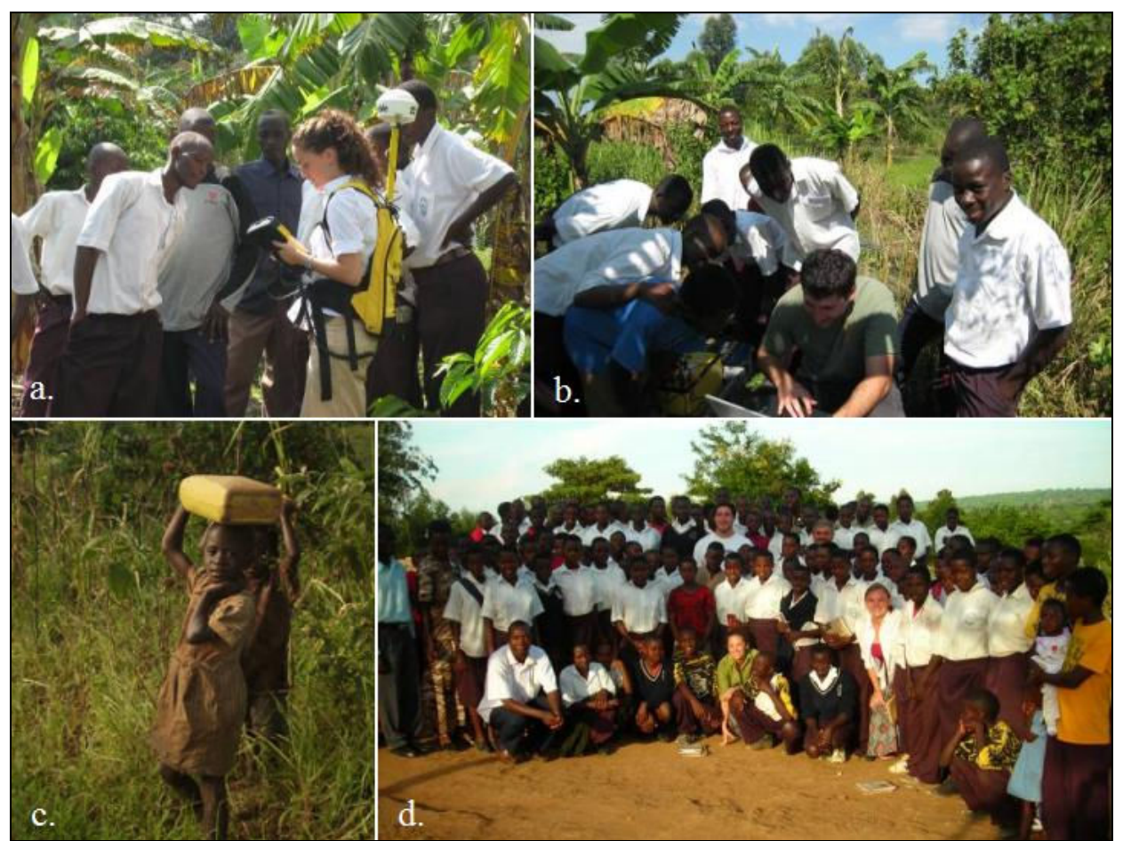
Figure 2. Images of visit to St. Denis.

In November of 2007, Into Your Hands coordinated student travel to St. Denis for site reconnaissance. The student team met the staff of St. Denis, assessed the educational facilities, obtained water samples for analysis, and collected preliminary geophysical measurements for hydrological exploration. Figure 2 depicts a) Colorado School of Mines students collecting global positioning satellite data to map the buildings within the St. Denis community, b) Colorado School of Mines students obtaining DC resistivity measurements to analyze subsurface conductance indicative of groundwater flow, c) a St. Denis student carrying a jerry can of drinking water, and d) a group photo including the Colorado School of Mines travelers.<sup>14</sup> This component of the project was funded through the The William and Flora Hewlett Foundation.